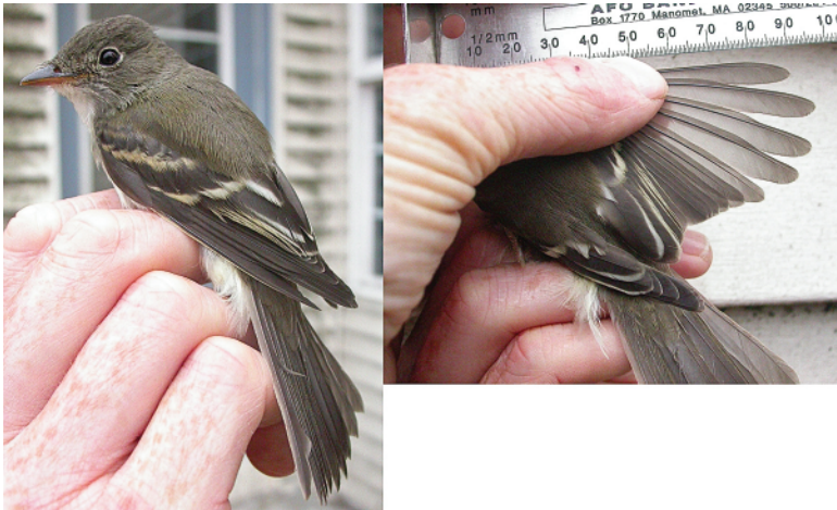
Figure 10. Acceptable documentation for an Alder Flycatcher ( Empidonax alorum ) in California ideally involves extensive close examination and measurements, as shown here in these profile and spread-wing views of bird captured on Southeast Farallon Island, San Francisco County, 8 September 2006. Structural and plumage characters distinguishing this bird from the three western subspecies of the Willow Flycatcher ( E. traillii ) included the relatively stout bill, thin eye-ring, bold white tertial borders (diffuse in western Willow Flycatchers), auricular-throat contrast, and green tones to the dorsal plumage. Discrimination of the Alder from the much more problematic eastern Willow Flycatcher ( E. traillii traillii ) requires a battery of measurements and wingtip-shape characters (ideally supplemented by diagnostic call notes, which were not heard from this captured individual).