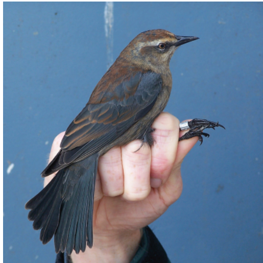
Figure 12. This first-year female Rusty Blackbird ( Euphagus carolinus ) was captured and banded on Southeast Farallon Island on 31 October 2006. Opportunities for finding and documenting Rusty Blackbirds in California have declined steeply in recent years in parallel to the species' overall significant decline.