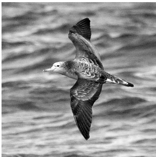
Figure 3. This photograph of a Streaked Shearwater ( Calonectris leucomelas ) taken in Monterey Bay on 15 October 2006 shows that the crown is pale, a dingy white, contrasting with a darker mantle. Some mantle feathers are edged pale, imparting the scaly look this species often shows. The dark-tipped bill is a pale straw color. Note the long dark tail, which has some pale whitish upper tail coverts; these upper tail coverts are quite variable, ranging from dark to an obvious white U-shaped band.