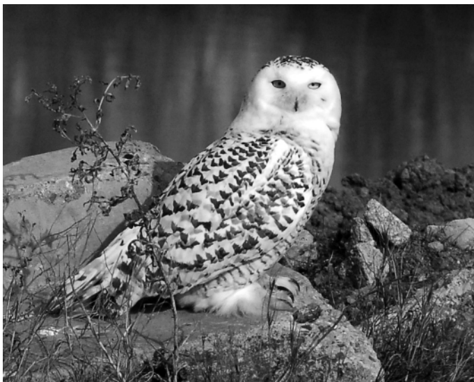
Figure 7. This Snowy Owl ( Bubo scandiacus ) was photographed on 19 January 2007 during its nearly month-long stay at Grizzly Bay, Solano County. It occurred approximately one year after another Snowy Owl nearby, so the question of whether this was a different individual arises. The heavily marked wings suggest a young bird, although some adult females are heavily marked too. Features not visible in this photo, such as an extensive white nape, thin tail bars, and uniform flight feathers support the conclusion that this was a first-winter bird. Older birds would likely show two generations of remiges.