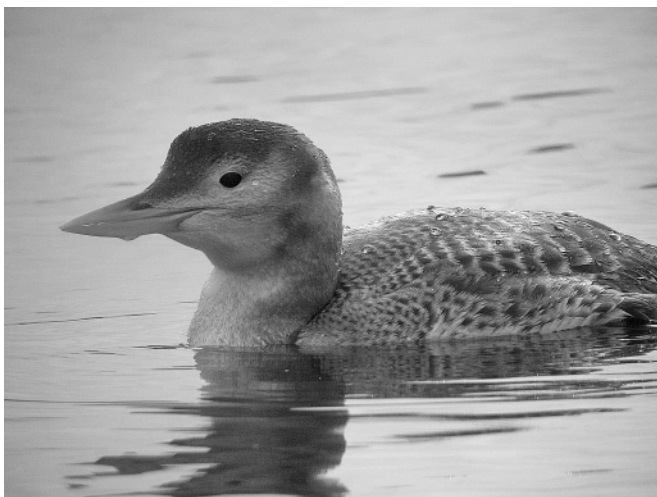
Figure 1. This crisp, close-up photograph provides great detail on the key identification marks of the Yellow-billed Loon ( Gavia adamsii ) at Pescadero, San Mateo County, 18–27 November 2006. The large pale bill is angled sharply on the lower mandible. Pale areas around the eye contrast with a darker crown and auricular; the back feathers are broadly edged paler, indicating a young bird.