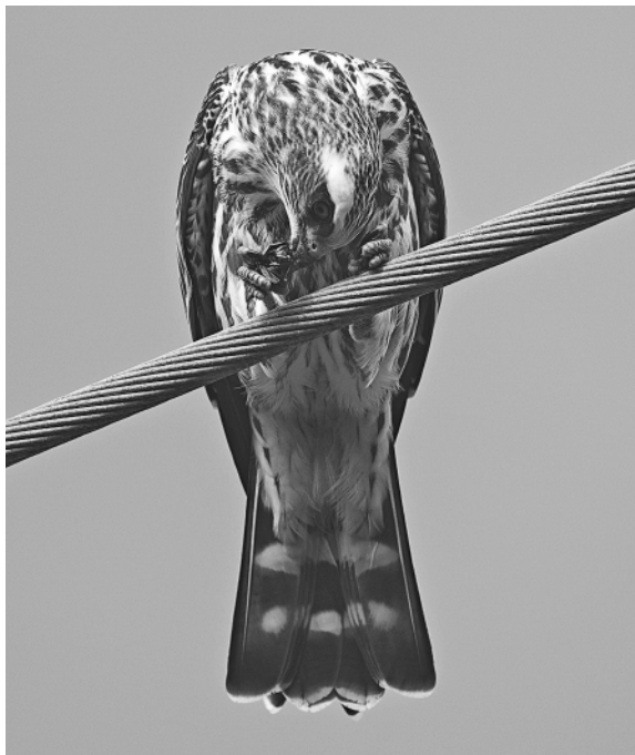
Figure 4. This juvenile Mississippi Kite ( Ictinia mississippiensis ) at Imperial Beach, San Diego County, 6–9 September 2006 was seen repeatedly capturing and devouring green fig beetles ( Cotinis mutabilis ), sometimes eating them on the wing. The tail is heavily banded with white, and the underparts are streaked brown.

COMMON BLACK-HAWK Buteogallus anthracinus (4, 0). An adult returning to near Santa Rosa, SON, 30 Apr–9 Oct 2006 (SM†; 2006-057) was presumed to be the same as the one there 14 May–29 Oct 2005 (Iliff et al 2007). Its schedule and prolonged stay raise many questions about its movements and vagrancy of the Common Black-Hawk in general. See also records not accepted, identification not established.