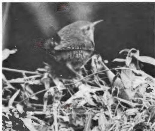
Winter Wren, Santa Paula Canyon, Dec. 14, 1974.