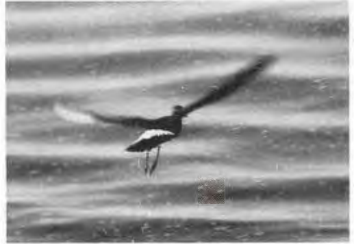
Hudsonian Godwit