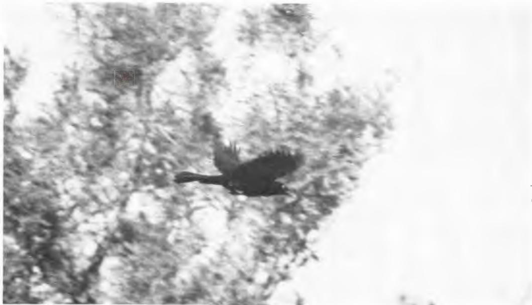
Common Grackle, 1st California record.

TANAGERS, FINCHES — A singing ♂ Hepatic Tanager was defending territory on Clark Mt. May 17 (GMCC), a locality where the species undoubtedly nests, and a straggler was at F.C.R. June 7 (GA, JM). Territorial ♂ Summer Tanagers had returned to Morongo Valley and the Brock Experimental Ranch by May 12 (GSS, JM); at least seven vagrants were seen in e. Inyo and San Bernardino Cos. between May 18 & 31, and three more were found on Santa Barbara I. May 26 - 29 (LJ, KG). Rose-breasted Grosbeaks were more numerous than usual with a least 11 seen in e. Mono, Inyo and San Bernardino counties May 17 - June 1, five more along the coast in Los Angeles, Orange and San Diego counties May 10 - June 9 and eight on Santa Barbara I. May 19 - June 8. As usual Indigo Bunting appeared in the e. part of the Region with eight reported there between May 18 and 31; in addition one was near San Diego May 13 (AF), another was on the Palos Verdes Pen. May 14 (AF), a female was found on San Miguel I. June 1 (LJ) and at least 12 were on Santa Barbara I. May 20 - June 8 (LJ, KG). Five Lawrence's Goldfinches near Parker Dam on the Colorado R. Apr. 12 (JD) were in an area from which few records have been made.