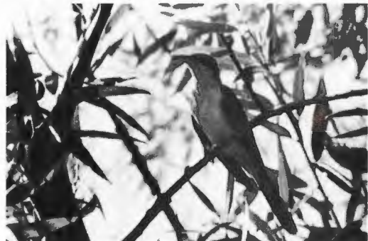
Yellow-billed Cuckoo, Kern County, Calif., Sept. 13, 1975.

FLYCATCHERS, SWALLOWS — Six E. Kingbirds were reported, with two in Goleta, Santa Barbara Co., Sept. 18-27 (PL, LB, LRB) one in Santa Barbara Oct. 2 (LB), one at Playa del Rey, Los Angeles Co., Sept. 5 (H&PB), one in Morongo Valley, San Bernardino Co., Sept. 15 (J&SL) and the other at Desert Center, Riverside Co., Sept. 1 (JD, DRo); this species is a regular straggler to s. California every fall. As usual a few Tropical Kingbirds moved north along the coast with