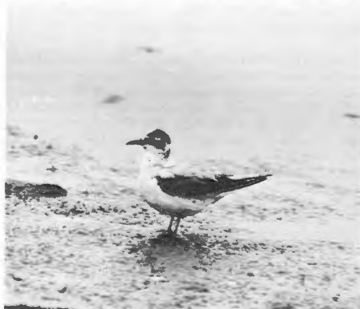
Little Gull, Goleta, Calif., Apr. 17, 1977.