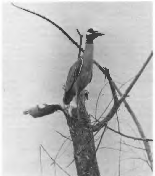
Yellow-crowned Night Heron, Irvine, Calif., May 11, 1977.

HERONS —Five ad. Little Blue Herons were found during May with one at Goleta, Santa Barbara Co., May 14–18 (PL, BS), one at McGrath S. P., Ventura Co., May 27 (LRB), a single bird at the north end of the Salton Sea (hereafter N.E.S.S.) May 7 (DM), another at the south end of the Salton Sea (hereafter S.E.S.S.) May 20 (PL), and a totally unexpected bird at Oasis, Mono Co., May 30 (DRU). A Cattle Egret at Stovepipe Wells in Death Valley May 24 (DRO) was at an interesting locality. An ad. Reddish Egret, a rare straggler to