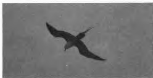
Long-tailed Jaeger, Lower Klamath N.W.R., Calif. Aug. 6, 1977.