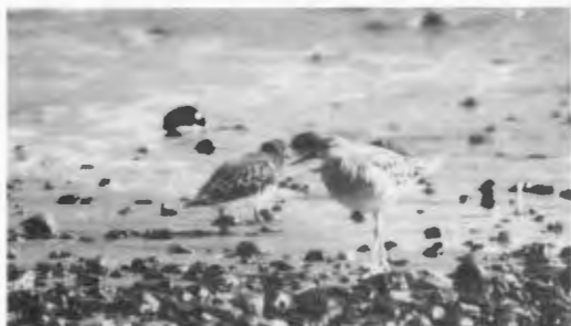
Ruff, Año Nuevo S.P., Calif. Nov. 2, 1977.