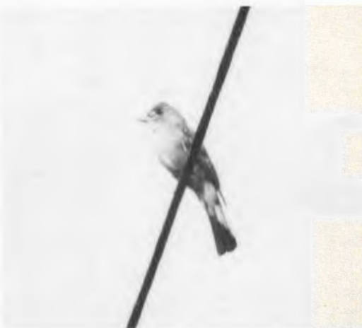
Coues' Flycatcher, Parker Dam, Dec. 24, 1977 – Mar. 19, 1978.

reported; this species is much more rare in s. California as a wintering bird than in former years. A Coues' Flycatcher was near Irvine Dec. 18-21 (EB) and another was at Parker Dam Dec. 24 – Mar. 19 (JD,KVR, ph. S.D.N.H.M.); this species remains very rare. A Vermilion Flycatcher at Pt. Mugu all winter (KG) and another at F.C.R. (TH,JD) marked the northernmost occurrences for the coast and interior this winter. A Rough-winged Swallow near Pt. Mugu Jan. 1 (LJ) was unexpected since winter records from along the coast are few, though the species does winter in small numbers in s.e. California.