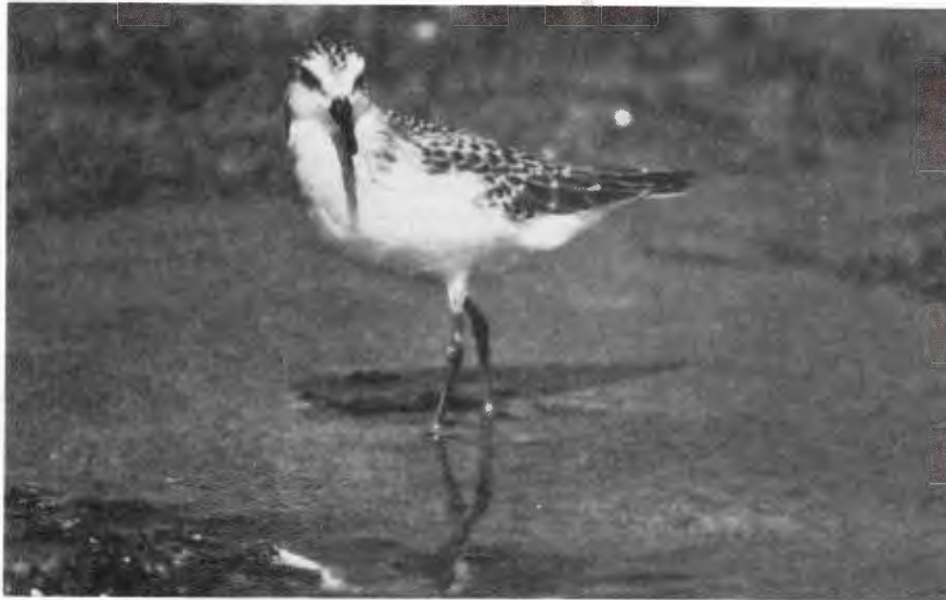
Immature Rufous-necked Sandpiper. Ventura County, Calif. September 4, 1978.

An imm. Rufous-necked Sandpiper was at McGrath S.P., Sept. 1-6 (REW, ph. S.D.N.H.M.); it very closely resembled an imm. Semipalmated Sandpiper in size, shape and coloration, but was believed to lack the partial webbing between the toes, clearly had rufous edgings to some of the back feathers and bold rufous edgings to the tertials; there are two previous records of this Asiatic sandpiper in California.