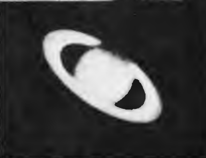
C90 Astro Telescope