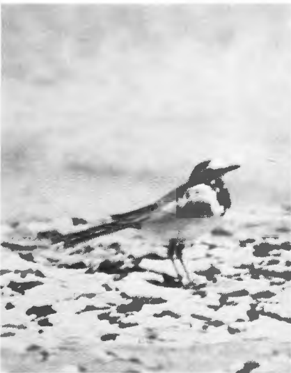
White Wagtail, Santa Cruz Co., Calif., Aug. 24, 1979.