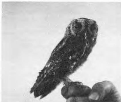
Flammulated Owl, Yolo Co., Calif., Oct. 16, 1979.

Fifteen to twenty Barn Owls were at Home Bay, P.R.N.S., Nov. 6 and a pair with four young Sept. 1 was at Pt. Reyes Station (Dianne Williams, fide JE) at the same spot where six young were seen May 18 (JE). It is assumed that this pair double-clutched this season, owing to the continued microtine outbreak in the Pt. Reyes area. Most unusual was the occurrence of a Flammulated Owl near Woodland, Yolo Co., Oct. 16 ( fide †CH, †TBe). The bird,