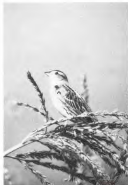
Bobolink, Goleta, Calif., Sept. 22, 1979.