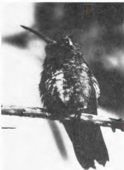
Male Broad-billed Hummingbird, Santa Barbara, Calif., Oct. 9, 1979.

of normal occurrence. As usual a few White-winged Doves strayed W to the coast with ten reported between Santa Barbara and San Diego Aug. 21 - Nov. 20. Unexpected were single Ground Doves at F.C.R., Oct. 10 (REW) and 25-28 (LLN), along with one in San Pedro Oct. 28 (FH), and another in nearby Westwood Nov. 23 (FH); F.C.R. is n. of the species' normal range and few have been found in the Los Angeles area. Two Yellow-billed Cuckoos near Tecopa Aug. 25, with one still present Sept. 17 (JT) were believed to have nested locally. A Long-eared Owl at Gaviota, Santa Barbara Co., Oct. 8-26 (LRB) was one of a very few ever found in this area. A group of 25 Short-eared Owls near the Santa Maria R. mouth Nov. 23-30+ (LB) was a significant concentration. Reports of Poor-wills believed to be migrants included two in Gaviota Oct. 7 (GFu), one in Goleta Aug. 27 (PL), one near Oxnard Nov. 4 (REW) and another on Pt. Fermin Oct. 8 (BD). A Black Swift over Fillmore Sept. 1 (REW) was the only migrant reported. Five Broad-billed Hummingbirds were found with a male 20 mi n. of Blythe Sept. 30 - Nov. 30+ (SC), another male in Cabazon, Riverside Co., Sept. 24 (LJ), a female in Gaviota Oct. 10 - Nov. 30+ (LRB, ph., S.D.N.H.M.), a male in Santa Barbara Oct. 9-14 (LRB) and another male in San Diego Nov. 28-30+ (JD); this species is now occurring annually and apparently increasing.