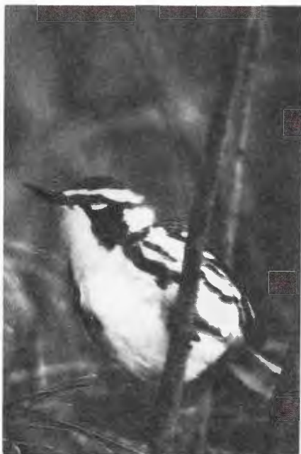
Yellow-throated Warbler, Gaviota, Calif., Oct. 25, 1979.

Marina del Rey Nov. 17 - Dec. 2 (JAJ), but one in the Antelope Valley Oct. 7-10 (TC) and another near Daggett Oct. 3 (EAC) were the only two inland. A Bay-breasted Warbler at Stovepipe Wells in Death Valley Oct. 2 (REW), one in Santa Barbara Oct. 13 (LB), and another in Imperial Beach Oct. 6-10 (PU) were the only three reported. Blackpoll Warblers were relatively numerous with 75± reported Sept. 12 - Nov. 4; one at F.C.R., Oct. 2 (REW) and another in Whitewater Canyon Sept. 12 were the only two found inland, and one on Pt. Loma Nov. 22 (DPA) was exceptionally late.