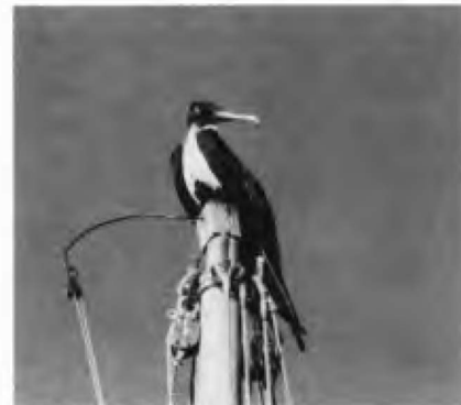
An ad. ♀ Magnificent Frigatebird perched atop a sailboat mast, King Harbour, Redondo Beach, Jan. 4, 1980.