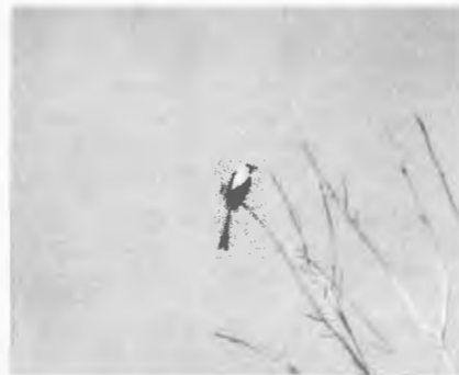
Scissor-tailed Flycatcher present near Corona Jan. 6 - Feb. 2, 1980.

FLYCATCHERS, SWALLOWS — A Tropical Kingbird at Pt. Mugu Jan. 12 - Feb. 29+ (REW) was wintering locally. Cassin's Kingbirds were found wintering in small numbers along the entire coast with two in San Luis Obispo Dec. 16+ (FRT) and two more at nearby Pismo Beach throughout the period (EVJ) being the northernmost. A Scissor-tailed Flycatcher near Corona, Riverside Co., Jan. 6 - Feb. 3 (MAP, ph. S.D.N.H.M.) was one of fewer than a half-dozen ever found in California in winter. Ash-throated Flycatchers are rarely found along the coast