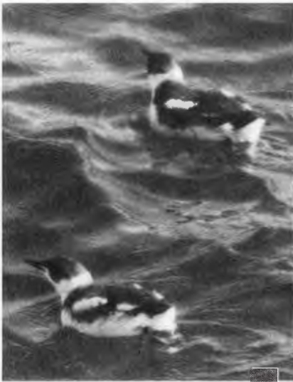
Two Marbled Murrelets at Imperial Beach, Dec. 16, 1979, established the southernmost record for the species.