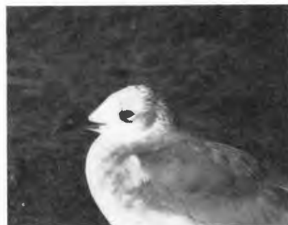
A first-winter Laughing Gull, that remained in Carlsbad, Oceanside, CA, Jan. 23 - Feb. 4, 1980.