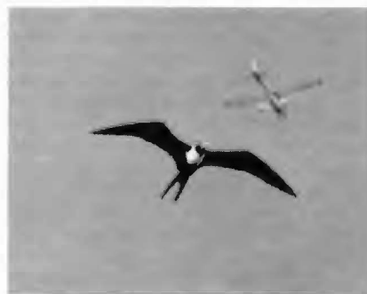
Easy and hard flight. An ad. ♀ Magnificent Frigatebird soaring over King Harbour, Redondo Beach, Jan. 4, 1980.

in Goleta, Santa Barbara Co., Feb. 8 (EG), another was at McGrath State Beach, Ventura Co., Jan. 1-29 (JM) and a third was near Imperial Beach, San Diego Co., Dec. 14 (EC). Cattle Egrets continue to increase, with small flocks present along the entire coast