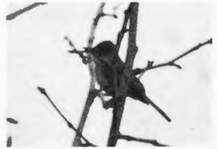
Olivaceous Flycatcher found wintering in Irvine.

in winter; hence, one in National City, San Diego Co., Dec. 15 - Feb. 3 (JO), another near Imperial Beach Jan. 31 - Feb. 2 (DPA) and a third on San Clemente I., Jan. 3 (PJ) were unexpected. California's fifth Olivaceous Flycatcher was in Irvine Dec. 30 - Feb. 10