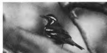
A Yellow-throated Warbler present at Oasis, Mono County, from May 29-June 1, 1980.