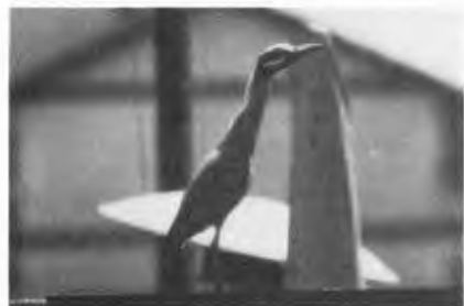
Yellow-crowned Night Heron, Ventura, Calif., Apr. 20, 1980.