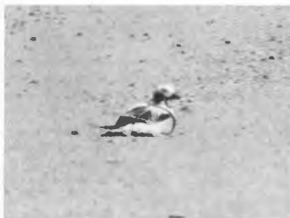
Oldsquaw, Santa Maria River mouth, San Luis Obispo Co., Calif., May 11, 1980.