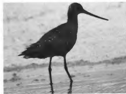
Hudsonian Godwit, Edwards A.F.B., Los Angeles County, Calif., May 11, 1980.

SHOREBIRDS —The Am. Oystercatcher first noted on Anacapa I. in 1964 was still present Apr. 27 (GSS). A Black Oystercatcher in Ventura Apr. 10 (JM), six on Pt. Fermin Mar. 2 (BSh), eight in San Pedro May 4 (FH) and two at Playa del Rey throughout the period (KG) were all found away from areas of normal occurrence. Three Semipalmated Plovers at Harper Dry L., San Bernardino Co. May 11 (EAC) and one at F.C.R., May 25 (JD) appeared in areas from which few have been reported; but small numbers were continuously present near Lancaster, and the species is common on the Salton Sea, indicating that it does move through the interior of s. California. Six wintering Am. Golden Plovers were still present near Santa Maria Apr. 20 (PL) and another remained at Playa del Rey to Mar. 22 (BMcl), but several were later seen migrating through: one near Morro Bay May 9-12 (FRT), six at the Santa Maria R. mouth May 15 (LBev), one at S.C.R.E. May 31-June 6 (JM), another at Pt. Mugu May 3 (REW) and single birds inland near Lancaster on Apr. 27 (JD), May 12 (LJ) & May 24 (KG). A Hudsonian Godwit near Lancaster May 9-19 (JD, ph. S.D.N.H.M.) was only the second to be found in s. Califor-