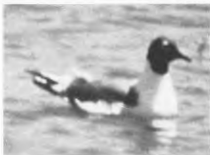
Adult Franklin's Gull near Santa Maria, Santa Barbara Co., Calif., May 6, 1981.