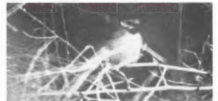
Hooded Warbler at Deep Springs, Calif., May 23, 1981.