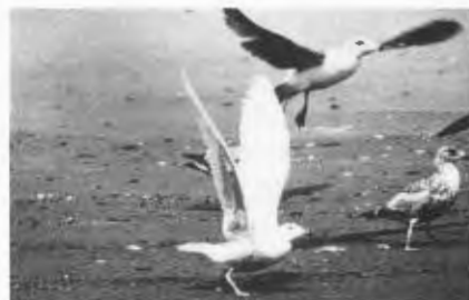
First-winter Glaucous Gull with Western Gulls, Goleta, Calif., Mar. 14-Apr. 18, 1981.

GULLS, TERNS, SKIMMERS —A first-winter Glaucous Gull was present in Goleta Mar. 14-Apr. 18 (JLD, ph., S.D.N.H.M.). A