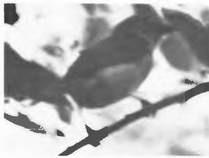
White-eyed Vireo, Malibu Cr., Calif., May 26, 1981.