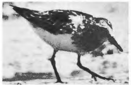
Adult Rufous-necked Stint, Santa Clara River estuary, Ventura Co., Calif., July 12-17, 1981.