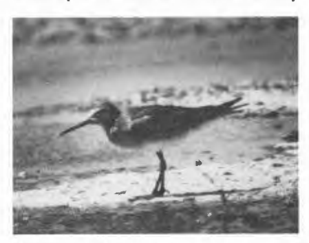
Polynesian Tattler, near Lancaster, Los Angeles Co., Calif., July 23, 1981.