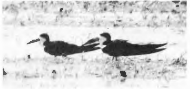
Pair of Black Skimmers, 3 mi n. of Paloverde, Calif., in flooded fields, July 30, 1982.