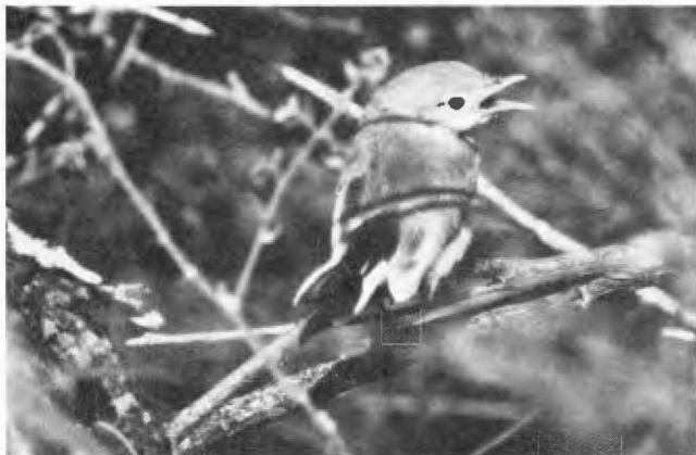
Imm. Black-capped Gnatcatcher, Tucson, Ariz., Sept. 2, 1981.

PIPITS TO VIREOS — Sprague's Pipits again appeared on the L.C.V., with singles n. of Ehrenberg Oct. 17 (WCH) and near Bullhead City Nov. 29 (KR). By early September, Chino Canyon's Black-capped Gnatcatcher pair had fledged eight young from 3 nests (GP et al. ). Numbers of Golden-crowned Kinglets in the L.C.V.,