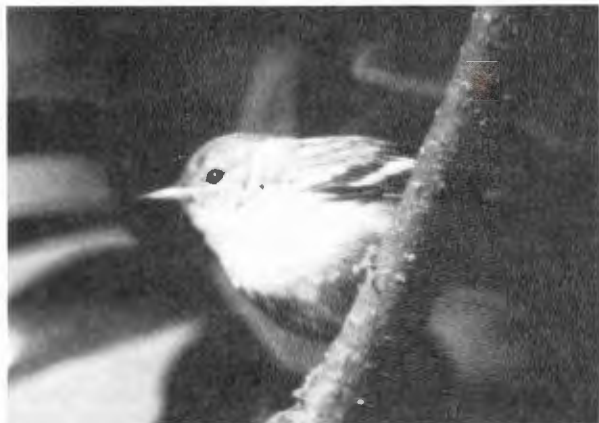
Bay-breasted Warbler (see above).