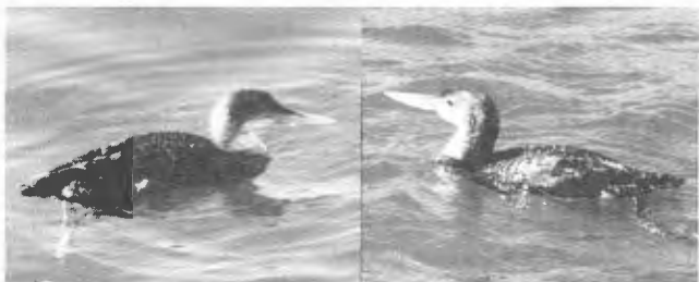
Yellow-billed Loon (see above). Yellow-billed Loon (see above).