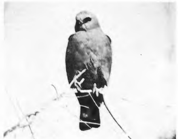
Mississippi Kite present at Furnace Creek Ranch, Death Valley, May 28-29, 1982.