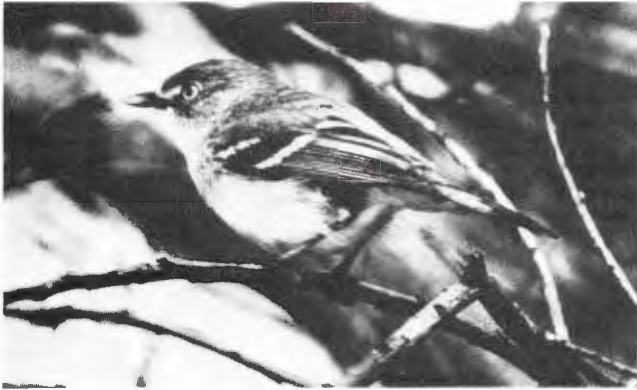
Adult ♂ White-eyed Vireo, Goleta, Santa Barbara County, May 20, 1982.

VIREOS, WOOD WARBLERS — A White-eyed Vireo was in Goleta May 18+ (PEL) and another was on Pt. Loma Jun. 7 (REW) to establish the fourth and fifth records for the Region. A Yellow-throated Vireo, a casual straggler to California, was at Los Osos, San Luis Obispo Co., Apr. 22-24 (DS) and another was at Turtle Rock Nature Center near Irvine, Orange Co., May 19 (DRW). The only Red-eyed Vireos found this spring were one on Pt. Loma May 18 (EC) and another at Stovepipe Wells in Death Valley N.M., May 24 (MD). Three Philadelphia Vireos were found, with one along the coast at Arroyo Grande, San Luis Obispo Co., May 22 (PS), another on Pt. Loma May 29-31 (NBB) and the third inland at Oasis May 29-30 (JML); there are no previous spring records for the coast.