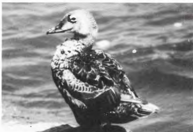
Female King Eider found summering in the Ventura Marina, Ventura, Calif.