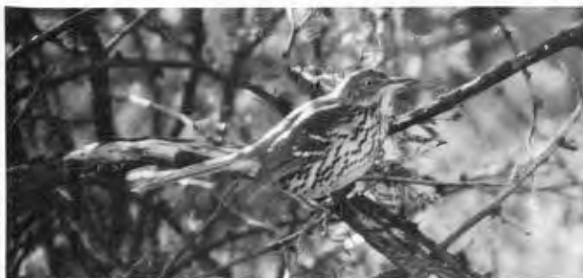
Brown Thrasher, Hereford, Ariz., Nov. 13, 1982.

Reports of Winter Wrens were widespread; an early one was near Portal Sept. 19 (RM) and other individuals during October and November were at S. Fork near Springerville (DDa, JBe), s.w. Phoenix (DSj), two n.w. of Phoenix (RF, PB), two at Prescott (RF) and two at Beaver Dam Wash near Littlefield (JC). Long-billed Marsh Wrens were so plentiful (100+) at Beaver Dam Wash Nov. 27 that they were foraging in the bark of cottonwood trees (JC).