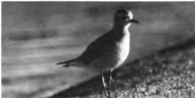
American Golden Plover, Phoenix, Ariz., Oct. 11, 1982.

SHOREBIRDS — Two Mountain Plovers n. of Elfrida Nov. 3 (AM) added to the recent records of this species in the southeast. An Am. Golden Plover at Phoenix Oct. 11-24 (ph. RW et al. ) furnished only the third record since 1976. Before that one or more had occurred annually since at least 1969. The only Black-bellied Plovers of the fall were two at Tucson Oct. 2 (BB, WD) and one w. of McNeal Oct. 27 (AM). Individual Snowy Plovers were at the Bisbee/Douglas sewage ponds Sept. 13 (AM), w. of Phoenix Sept. 5 (RBr, RF) and three at Tucson Sept. 1 (FH). One of the rarer shorebirds to pass through or over the state, the Red Knot, was recorded in two areas: one w. of Phoenix Sept. 7-18 (PB et al. ) and one at Nogales Sept. 17 (BH, RBa).