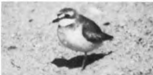
Mongolian Plover, McGrath Beach, Ventura Co., Calif., Aug. 10, 1982.