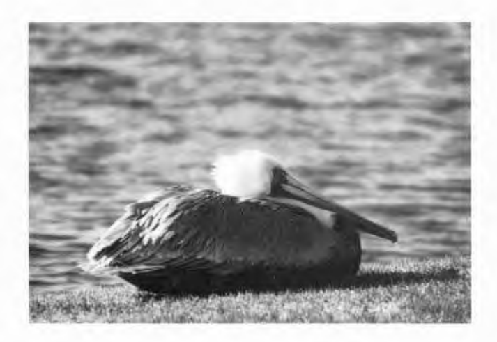
Brown Pelican, Phoenix, Ariz., Dec. 24, 1982.