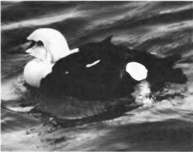
Adult ♂ King Eider, Imperial Beach, San Diego Co., Jan. 8, 1983.