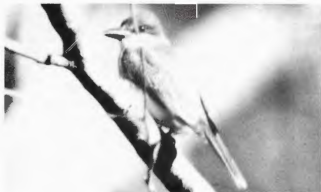
Thick-billed Kingbird, Peters Canyon near Tustin, Orange Co., all winter.