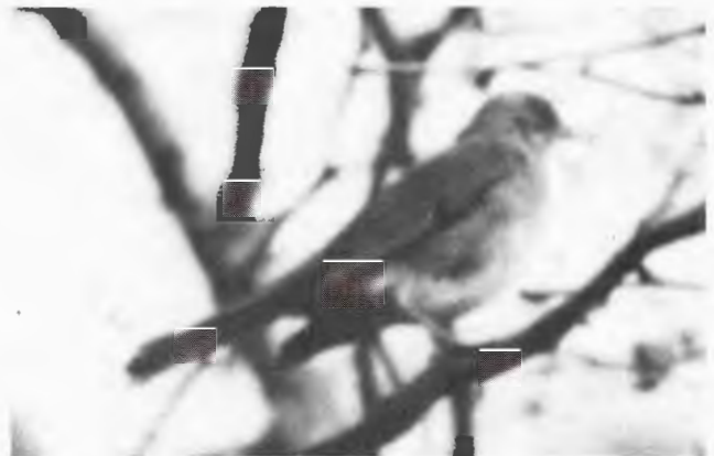
Rufous-backed Robin, Newport Beach, Orange Co., Feb. 11, 1983.