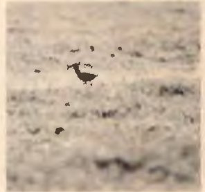
Little Curlew (Numenius minutus) near Santa Maria, Cal., Oct. 2, 1984. First record for North America.