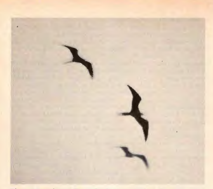
Three Magnificent Frigatebirds near Madera Canyon, Ariz., during a storm July 6, 1985.

WATERFOWL THROUGH RAPTORS — Black-bellied Whistling-Ducks were present at the Patagonia Sanctuary all summer for the first time (R. Baxter). Wood Ducks nested again at Prescott (at least one pair) and at Clarkdale (at least 2 pairs) in June (CT). A Green-winged Teal (an uncommon nester) remained into July in Prescott (CT), and one was observed at Green Valley July 18 (TM). Two Mallards with "Mexican Duck" characteristics, observed on the Gila R. near Kearny July 26, were n. and w. of the normal distribution of this form (†CH, TC).