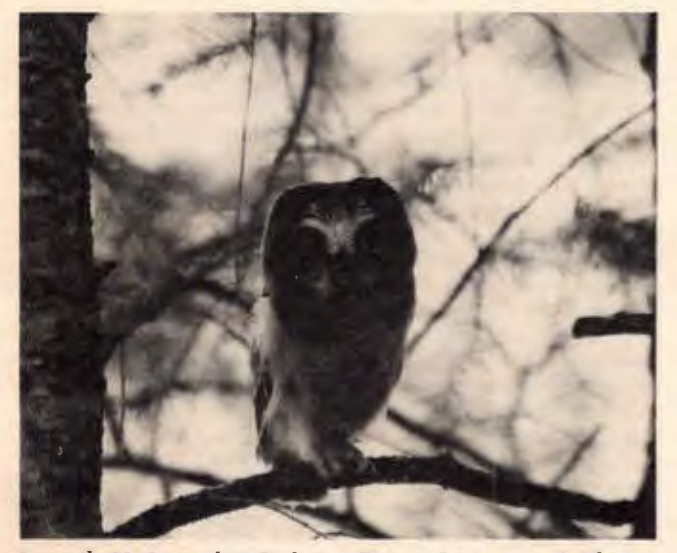
Juvenile N. Saw-whet Owl near Pinery Campground, Chiricahua Mts., Ariz., May 28, 1985.

A Flammulated Owl was heard calling in the Lukachukai Cr.