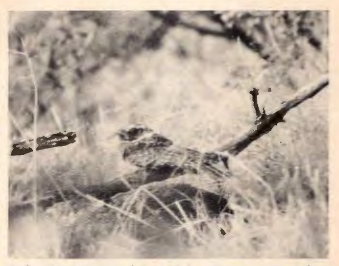
Buff-collared Nightjar below Madera Canyon, Ariz., July 7, 1985. Fledglings were found later at this site, for the first confirmed U.S. nesting.

A new nesting record for Arizona and the United States was provided by a pair of Buff-collared Nightjars below the entrance to Madera Canyon that produced two young in mid-July (†EH, †MJ, m.ob.). There were also records of individuals e. of Tucson July 1 (CdeW, SSu) and at Catalina S.P., July 3 (SSu).