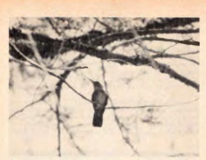
Berylline Hummingbird in S. Fork, Cave Creek Canyon, Chiricahua Mts., Ariz., June 29, 1985.