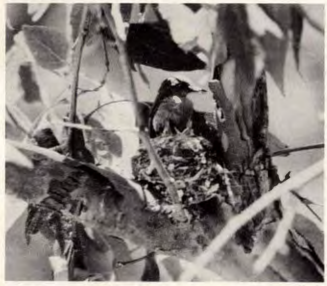
Female Black-capped Gnatcatcher at a nest in an Arizona Sycamore (appropriately) in Sycamore Canyon, Ariz., July 27, 1986.