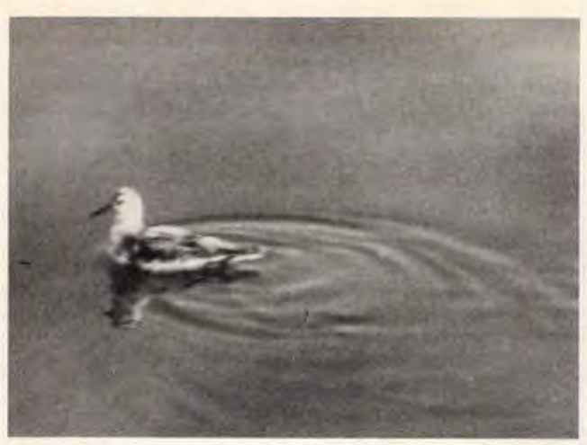
Red Phalarope at Cunningham Wash, Ariz., June 1986.