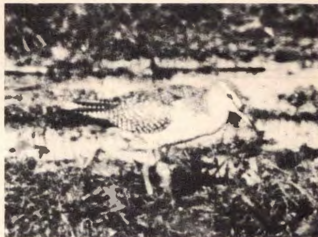
Juvenile Spotted Redshank near Santa Maria, Cal., Oct. 25, 1985.

SHOREBIRDS THROUGH ALCIDS — Single Lesser Golden-Plovers at Tulare L., Kern Co., Sept. 28 (MH) and Oct. 5 (RS) were the only ones found inland; 30± along the coast between Sept. 1 and Nov. 27 was about average. A Mountain Plover on the beach at Morro Bay Oct. 15 (LT) was in atypical habitat. Nineteen Black Oystercatchers on the Long Beach/Los Angeles Harbor breakwater Oct. 11 (LRH) was an exceptional concentration for this locality. A juv. Spotted Redshank near Santa Maria