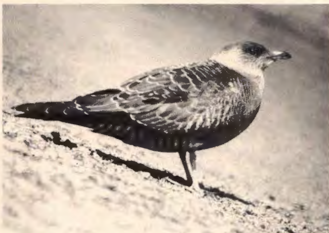
Juvenile Long-tailed Jaeger near Lancaster, Los Angeles Co., Cal., Sept. 11, 1985.

At least 10 Parasitic Jaegers were found inland at various points around the Salton Sea between Aug. 31 and Sept. 29 and another flew over the "Condor Lookout" along the Mil Potrero Highway near Mt. Abel Aug. 31 (EJ). A juv. Long-tailed Jaeger found dead at S.E.S.S., Sept. 5 (REM, *S.D.N.H.M.) and another juvenile near Lancaster Sept. 7-11 (AS) were both inland where