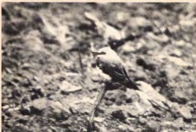
Scissor-tailed Flycatcher near Lompoc, Cal., Sept. 11, 1985. Photo/Paul Lehman.

two in Whitewater Canyon, Riverside Co., Oct. 2+ (DCH) were at unusual localities. A Bendire's Thrasher near Lancaster Oct. 12 (FH), the only one found this fall, was in an unexpected area. A calling imm. White/Black-backed wagtail seen well in flight when flushed from the San Joaquin Marsh, Orange Co., Oct. 27 (JBo) was the fourth such bird found in s. California during fall and early winter. A Red-throated Pipit, very rare along the coast during October, was near Imperial Beach Oct. 6-11 (GMcC), and another at F.C.R., Oct. 5 (JLA) provided our first inland record. An imm. N. Shrike at Oasis Nov. 10 (SM) was in the extreme n.e. corner of the Region where one or two occur most years.