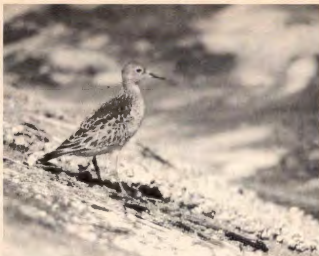
Buff-breasted Sandpiper near Lancaster, Los Angeles Co., Cal., Sept. 10, 1985.

At least 10 Parasitic Jaegers were found inland at various points around the Salton Sea between Aug. 31 and Sept. 29 and another flew over the "Condor Lookout" along the Mil Potrero Highway near Mt. Abel Aug. 31 (EJ). A juv. Long-tailed Jaeger found dead at S.E.S.S., Sept. 5 (REM, *S.D.N.H.M.) and another juvenile near Lancaster Sept. 7-11 (AS) were both inland where