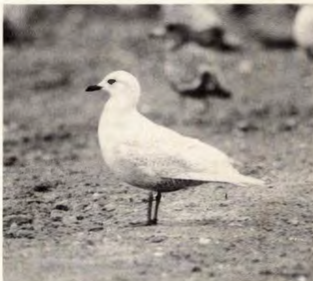
First-winter Iceland Gull in San Diego Co., Cal., Jan. 20, 1986. Perhaps the first uncontested California record, if such an event were possible.

GULLS THROUGH ALCIDS — A Laughing Gull 2 mi off Santa Barbara Dec. 10 (LBe, *U.C.S.B.) was only the 2nd ever to be found in Santa Barbara County. An ad. Mew Gull at Salt Creek on the e. shore of the Salton Sea Feb. 1 (GH) and a first-winter bird at S.E.S.S., Feb. 1 (GMCC) were the only ones found well inland, and nine together on L. Cachuma Feb. 25 (PEL) made an unexpected concentration for such a locality.