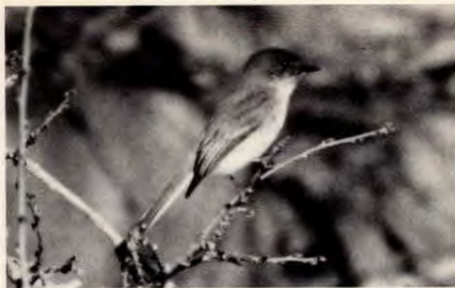
Eastern Phoebe in Twenty-nine Palms, Cal., Jan. 5, 1986.