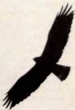
Adult Zone-tailed Hawk over the Plano Trabuco, Cal., Dec. 22, 1985.