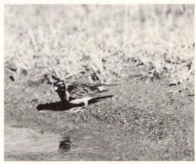
Male Lapland Longspur at Furnace Creek Ranch, Death Valley, Cal., May 3, 1986.

As usual a few Bobolinks occurred in the n.e. portion of the Region with two at Oasis May 24 (C & ES), one at Scotty's Castle May 24 (DR), and five at F.C.R. between May 24 and 31 (PDG, BED). A Great-tailed Grackle near Weldon, Kern Co., Mar. 7 (RHe), single birds at L. Casitas, Ventura Co., all spring (RM), in Ventura Mar. 13-19 (KPS), and at Santa Clara R. mouth