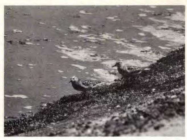
Semipalmated Sandpiper (rear bird) with Least Sandpiper at San Luis Obispo, Cal., between May 10 & 12, 1986.