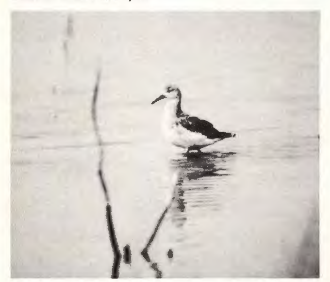
Female Ruff in basic (winter) plumage at Pt. Mugu, Cal., Mar. 4, 1986.