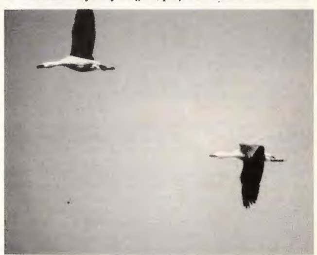
Fulvous Whistling-Ducks in flight near California City, Cal., May 16, 1986.

WATERFOWL, RAPTORS — Three Fulvous Whistling-Ducks, now considered accidental away from S.E.S.S., were in California City May 16 (JWi, ph.). Two Black-bellied Whis-