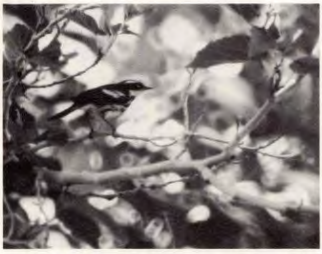
Male Magnolia Warbler at California City, Cal., May 26, 1986.

WOOD WARBLERS — Wood warblers were scarce throughout the Region, with most observers commenting on the lack of the regularly-occurring w. species during April and early May, and a poor showing of vagrant species in late May and early June. Eleven Tennessee Warblers between May 9 and June 8 were far fewer than expected. Only four N. Parulas were found with a somewhat early male in Orange Apr. 20 (SGa), a male in California City May 18 (JWi, ph.), another at F.C.R., May 25–30 (PJM), and the 4th at Ft. Piute, San Bernardino Co., May 25 (SFB). The wintering Chestnut-sided Warbler in Arcadia was last seen Apr. 13 (BCo), and a male in California City May 31 (NBB) was the only one this spring. Only three Magnolia Warblers were found with single birds in California