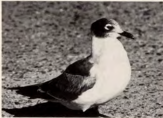
First-winter Franklin's Gull at Santa Barbara, Cal., Oct. 13, 1986.