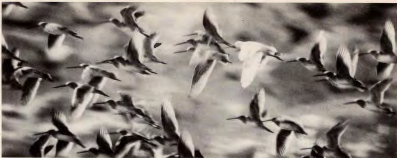
Albino dowitcher (probably Long-billed) with a flock of Long-billed Dowitchers near Chino, San Bernardino Co., Cal., Sept. 22, 1986.

doubtedly the same bird that was present here last winter. A Stilt Sandpiper in San Luis Obispo Oct. 7 (ph. GPS), up to six at Pt. Mugu, Ventura Co., Oct. 12–Nov. 16 (JSR), and another in Long Beach Aug. 31–Sept. 6 (BN) were all along the coast where considered very rare to casual. A Buff-breasted Sandpiper, very rare in California, was near Imperial Beach Oct. 11 (RM). Ruffs were more numerous than usual with as many as seven near Santa Maria between Aug. 31 and Oct. 17 (DRW, CDB) including four together Oct. 6 (KJZ), one in Anaheim Sept. 5–12 (DRW), one on Batiquitos Lagoon, San Diego Co., Sept. 4–13 (REW), another near Imperial Beach Sept. 13 (GMCC), and the returning male on San Diego Bay Aug. 17+ (JO'B) all being along the coast, and single birds near Norco, San Bernardino Co., Aug. 22 (LRH), at S.E.S.S., Aug. 3 (JO), and in El Centro Nov. 4+ (RHi) being inland. A Com. Snipe near Santa Maria Aug. 2 (GPS) was an early migrant.