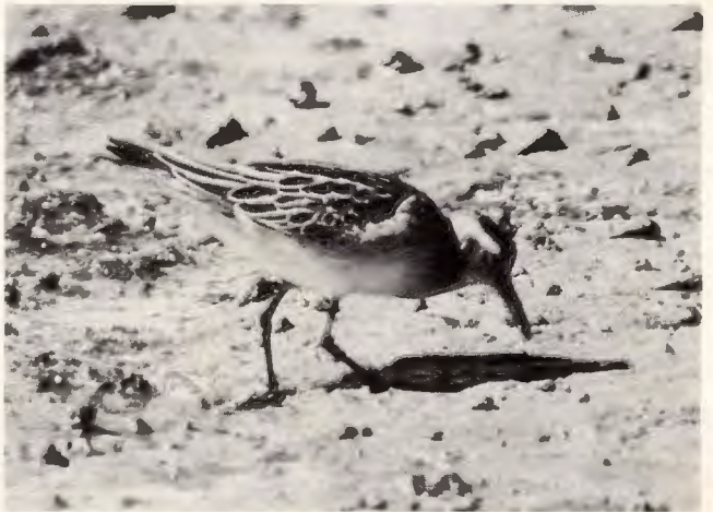
Juvenile Sharp-tailed Sandpiper at Upper Newport Bay, Cal., Oct. 14, 1986.