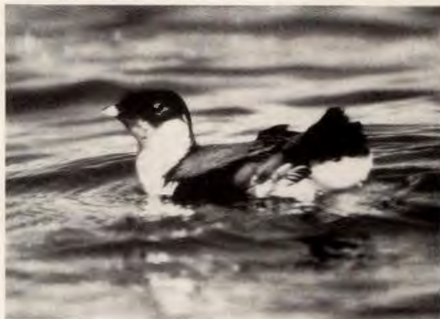
Ancient Murrelet on Newport Bay, Cal., Nov. 12, 1986.