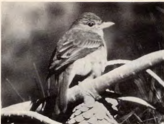
Summer Tanager at California City, Cal., Nov. 16, 1986. Note that this fresh-plumaged bird, seen from this angle, shows a faint suggestion of wing-bars.

were single birds near Santa Maria Nov. 2 (PEL) and in Goleta Nov. 4-5 (PEL), two near Oxnard Nov. 2-16 (JSR), and up to two on the Plano Trabuco Nov. 28+ (JLD) along the coast, and single birds inland at F.C.R., Nov. 19 (JLD) and near S.E.S.S., Nov. 20 (RHi). Chestnut-collared Longspurs were relatively scarce with one near Oxnard Nov. 2-16 (JSR), up to eight on the Plano Trabuco Nov. 10+ (BED), one near Needles Nov. 16 (BED), and two in Baker Oct. 12 (EAC) being the only ones reported.