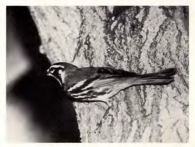
Yellow-throated Warbler at California City, Cal., May 14, 1987.

panying the Blue-winged Warbler at Butterbredt Springs May 29-30 (JCW), stimulating talk of possible "Brewster's Warblers." Seven Tennessee Warblers were fewer than expected, but included an exceptionally early male in breeding plumage at Morongo Valley Apr. 2 (MAP) and another earlier than expected individual in Santa Barbara Apr. 14 (PEL), both of which may have wintered along the w. coast. A & Lucy's Warbler at Oasis was a little n. of the species' normal range. Northern Parulas were more numerous than usual with 17 reported between Apr. 20 and June 13, most of which were inland. The only Chestnut-sided Warblers found were a female at Oasis May 25 (REW) and a male in California City May 30 (JML). Four Magnolia Warblers were seen with single males in Mojave May 10 (SEF), at Butterbredt Springs May 11 (SE), at Oasis May 25 (REW), and in the Saline Valley May 25 (LS). A & Cape May Warbler, a casual spring vagrant, was on Pt. Loma May 30-31 (BF). A Yellow-rumped (Myrtle) Warbler at F.C.R., May 27 (BED) was late. A & Black-throated Green Warbler photographed near San Diego June 7 (LW) was only the 9th to be found in s. California in spring. A & Yellow-throated Warbler, another casual spring vagrant, was in California City May 14 (NBB). A & Grace's Warbler in Ventura Mar. 14-Apr. 4 (RJM) had undoubtedly wintered locally, but was a different bird from that known to have spent the past 3 winters there, being more than a mile from where that bird winters.