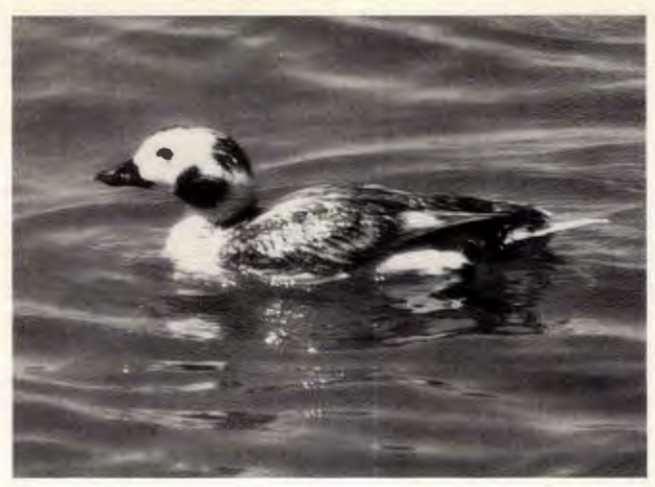
A lingering Oldsquaw at Salton City, Cal., Apr. 26, 1987.