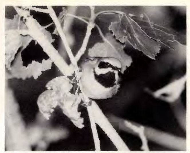
Golden-winged Warbler at Butterbredt Springs, Cal., May 30, 1987. This male Golden-winged was associating with the female Blue-winged present on the same date.

A & Blue-winged Warbler at Butterbredt Springs May 9 (MOC) was followed by a female there May 29–30 (JLD) bringing the total number now found in s. California to 10. A & Golden-winged Warbler, about the 25th to be found in s. California, was at Oasis May 23 (PJM) and another was accom-