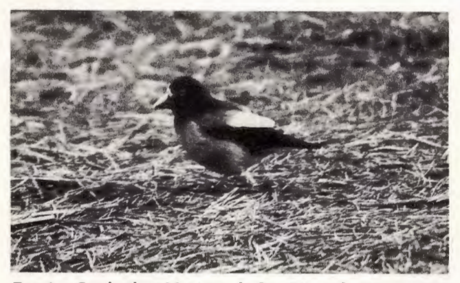
Evening Grosbeak at Montana de Oro S.P., Cal., May 9, 1987.

TANAGERS THROUGH SPARROWS - The 9 Hepatic Tanager that wintered in Irvine remained through Apr. 13 (DRW). Seven Summer Tanagers along the coast between Apr. 27 and June 7 along with nine more at desert oases between May 14 & 31 were about average, all of these birds suspected to be of the race rubra straggling from the East rather than birds of the w. race cooperi. A 9 Scarlet Tanager in Coronado, San Diego Co., May 7 (EC) was one of a very few to be found in California in spring. A pair of N. Cardinals along the Colorado R. near Vidal Apr. 15 (BED) was in the very limited area within California still supporting this species. Eight Rose-breasted Grosbeaks during May were far fewer than normal, but 35± Indigo Buntings during the same period were above average with an early male seen at Vallecito, e. San Diego Co., Apr. 15 (BA). A & Painted Bunting at Scotty's Castle May 22 (PEL) was only the 2nd to be found in s. California in spring. A Dickcissel