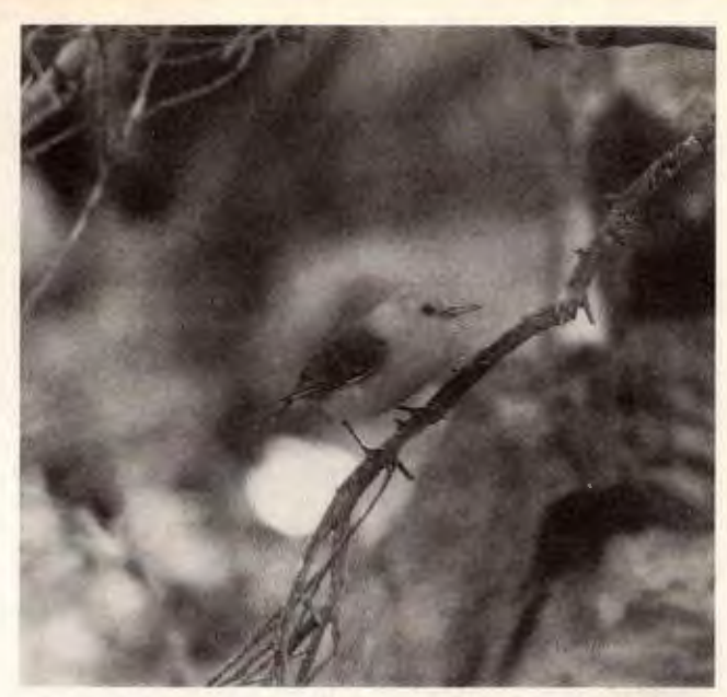
Prothonotary Warbler at Phoenix, Ariz., Oct. 26, 1987.

WOOD-WARBLERS — A Tennessee Warbler, one of the more regular e. vagrants, was at Patagonia Oct. 10 (RS). A N. Parula, much rarer in fall than in spring, was at Pipe Springs N.M. on the Utah border Sept. 16 (GR), and another was on the upper S.P.R., Sept. 19–20 (TC, DK). At least four Chestnut-