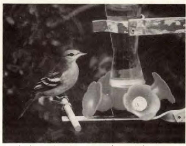
Female-plumaged "Baltimore" Northern Oriole at Prescott, Ariz., August 1987.