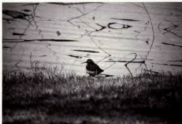
Solitary Sandpiper at California City, California, May 6, 1988.

SHOREBIRDS — Four wintering Lesser Golden-Plovers were still present at Seal Beach, Orange, Mar. 24 (NBB), and one on Vandenburg A.F.B., Santa Barbara, Mar. 27 (KH) could also have wintered locally; but a bird of the American race dominica near Santa Maria May 29 (BS) and another of the Asiatic race fulva inland at N.E.S.S. Apr. 23 (GMCC) were spring migrants. A bird identified as an Am. Oystercatcher x Black Oystercatcher hybrid was at the w. end of Santa Cruz I. Mar. 23 (MAH). Five Black Oystercatchers together on the Palos Verdes Pen. Mar. 3 (JLC) represented a large number for such a location. The wintering Solitary Sandpiper near Imperial Beach remained through Apr. 13 (CGE); seven scattered throughout the Region Apr. 10-May 7 were more than normally reported in spring. Whimbrels were constantly present at H.D.L. Mar. 26-May 19 with a peak of 89 Apr. 11 (EAC)