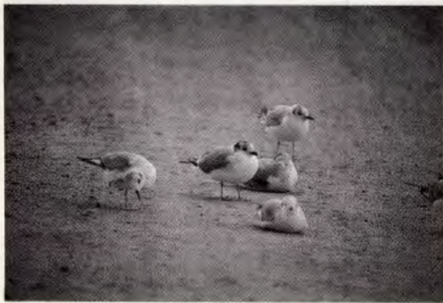
Sabine's Gull surrounded by Bonaparte's Gulls at the sewage ponds at Lancaster, California, May 5, 1988.