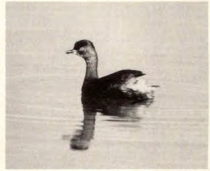
Least Grebe near Niland, California, November 22, 1988. Second state record.

LOONS TO FRIGATEBIRDS — Two Pacific Loons, rarely found inland, were on Quail L., Los Angeles, Oct. 27 (MH). Up to three Com. Loons at F.C.R. Oct. 22–29 (MAP) were at an unusual locality. A Least Grebe near Niland, Imperial, Nov. 19 to the end of the period (JM) gave us the first documented occurrence of this species in California since 1946, when the finding of six adults and three young along the Colorado R. immediately below Imperial Dam in October added the species to the State list. Two Horned Grebes, rare inland, at China L., Kern, Oct. 19 (DVB) were followed by two