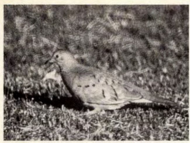
Female Ruddy Ground-Dove at Furnace Creek Ranch, Death Valley, California, November 12, 1988.

male was found by 2 visiting birders from Massachusetts in the Tijuana R. Valley near Imperial Beach Oct. 12–20 (GMcC); a female was at the same location Oct. 22–24 (EP); a male was at F.C.R. Oct. 21–Nov. 3 (REW); and up to three females were there Nov. 3 through the end of the period with three photographed Nov. 12 (SFB, JLD) and two still present Dec. 3 (GMcC). These support the theory that this species is expanding its range with individuals pushing northward in the fall as did the Inca Dove some 100 years ago, though it is not clear that the northward movement of Inca Dove took place in fall. A Groove-billed Ani photographed at Galileo Hill Oct. 14–15 (JWi) was a straggler from w. Mexico and only the 4th ever found in California.