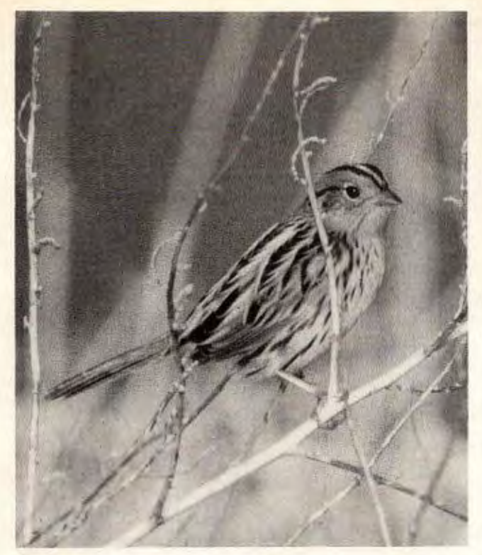
Le Conte's Sparrow at China Lake, California, December 3, 1988. Photograph/Rick Hallowell.

Sweetwater R. Sept. 3 (PU) and single birds identified on Upper Newport Bay, Orange, Nov. 9 (KLG) and Nov. 24 (BED), one at Seal Beach Nov. 22 (LRH), and two at S.C.R.E. Sept. 23 (RJM), for the first such influx in more than 30 years.