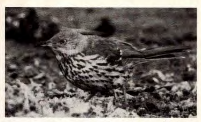
Brown Thrasher at Bodega, California, January 3, 1989.

The newly established W. Bluebird frontier in Lee Vining had three spring arrivals Feb. 25 (ES). Mountain Bluebird was the only thrush well reported (35 reports along interior valley edges), including one at Modoc N.W.R. Feb. 14 (ECkB). Brown