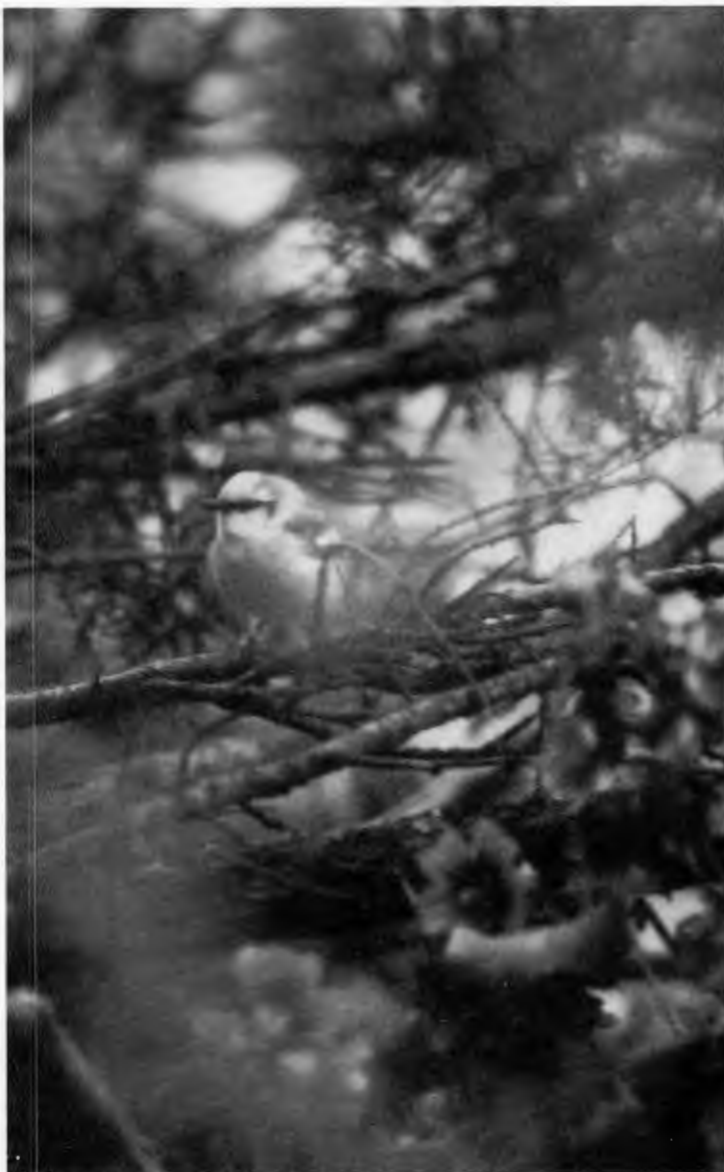
Blue-winged and Golden-winged warblers are both very rare in western North America, and their hybrids are even more so. This "Brewster's" warbler found June 6, 1991, on Southeast Farallon Island, California, provided only the third state record of such a hybrid.

The Region's 4th spring Golden-winged Warbler at F.I. June 3 (ph. †pp) was overshadowed by the state's and Region's 3rd Blue-winged x Golden-winged warbler at F.I. June 6 (ph. †pp). The hybrid was a ♂ "Brewster's type." In addition to the five Tennessee Warblers at F.I. June 2–4, two birds were at Pt. Reyes June 3 (RS, ASH), with one of them sporting a shiny new band, undoubtedly from F.I. the day before. On Glass Mt., a pair of Virginia's Warblers in Kelty Cyn. June 25 and 10+ birds (with confirmed breeding) in Frazier Cyn. June 29 (DS) indicated that