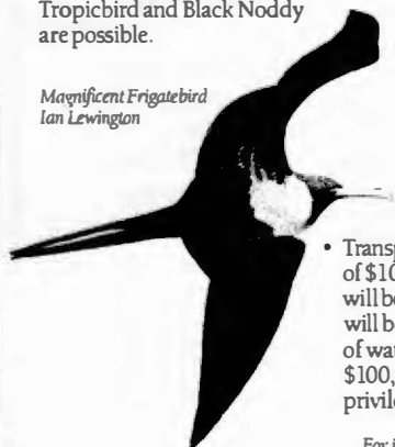
Magnificent Frigatebird Ian Lewington