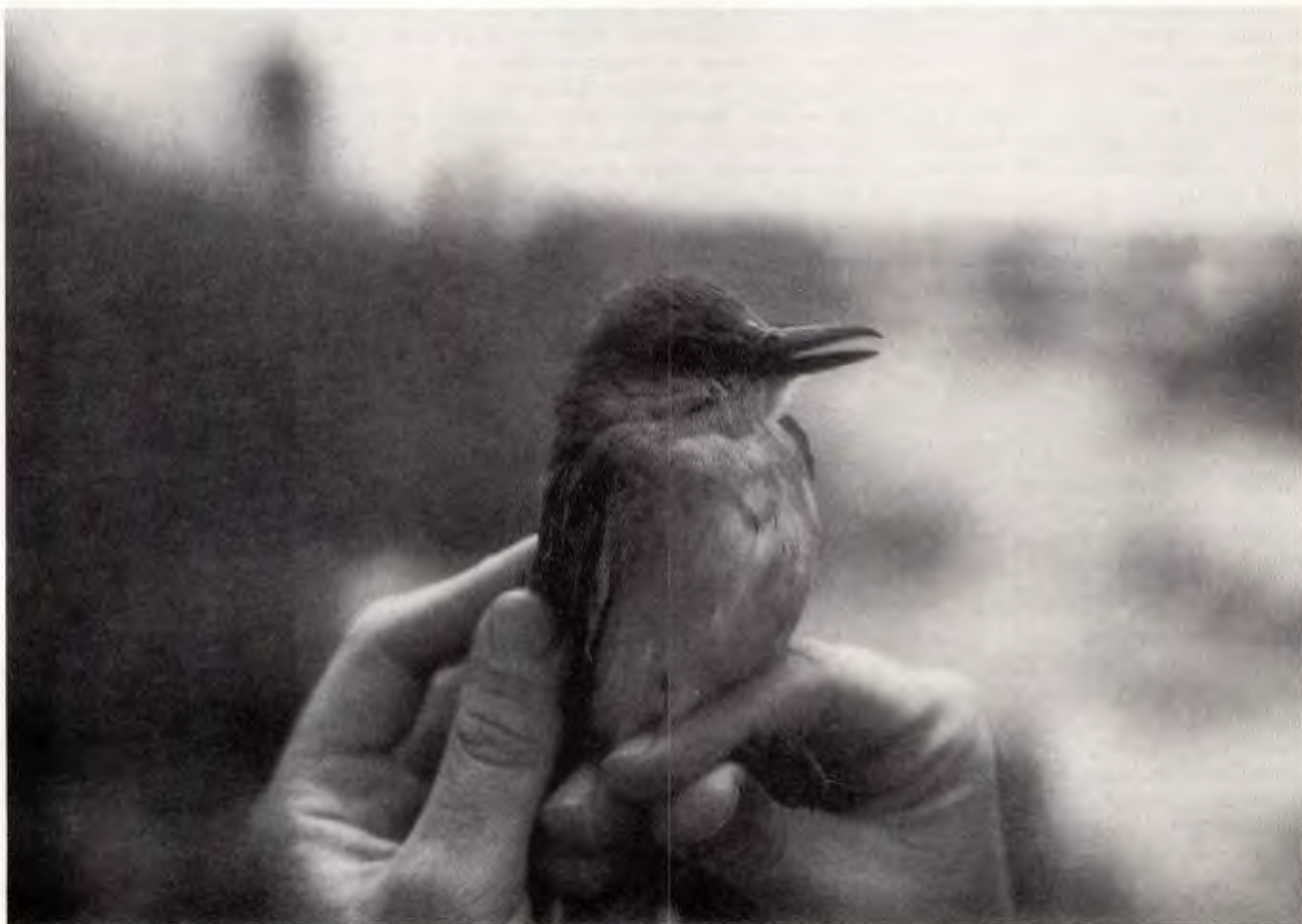
Tropical Kingbird on Southeast Farallon Island, California, June 6, 1991. Second spring record for northern California.

Common Ravens established a nesting first for the Sutter Buttes June 4 (WA). The rediscovery of nesting Mountain Chickadees near Cone Peak July 26 was considered Monterey's bird "event of the summer" (DR). A small population was presents until at least 1960, but recent visits failed to find them. It had been speculated that the species was extirpated by the huge Marble Cone fire of 1977. If recolonization has truly occurred, it is amazing considering that the nearest resident birds are in Santa Barbara 150 mi to the south, with no records in between (DR). A Mountain Chickadee at Pt. Reyes June 14