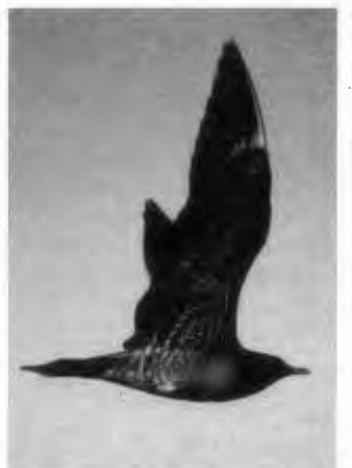
Juvenile Long-tailed Jaeger over the Tulare Lake Evaporation Ponds, California, August 31, 1990.

At least five Parasitic Jaegers were found Sept. 3-30 on the Salton Sea, where small numbers occur each fall, and one on Tinnemaha Res. Sept. 13-17 (JLD) established the 2nd record for Inyo . An ad. Long-tailed Jaeger photographed