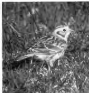
Lapland Longspur at California City, California, November 2, 1990.

Up to two McCown's Longspurs, rare stragglers to California, were in Irvine Oct. 19–Nov. 3 (DSi) and two more were near Imperial Beach Nov. 18–25