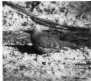
Male Ruddy Ground-Dove near Cantil, California, September 30, 1990. At least nine individuals reached southern California during the 1990 fall season.

As usual a few White-winged Doves reached the coast, with the northernmost being singles in Montana de Oro S.P. Sept. 7 (KAH) and Oct. 9 (TT). Up to four Inca Doves at F.C.R. after Oct. 19 (JLD) were well north of this species' normal range. Three Com. Ground-Doves near Lompoc Nov. 28 (SEF) were unusually far north, and one at Galileo Hill Oct. 12 (MTH) was the first for Kern. Ruddy Ground-Doves again pushed north into this Region with a female near Imperial Beach Sept. 8 (GMcC) for our earliest fall record, and a male at Deep Springs, Inyo, Sept. 26 (PEL) for