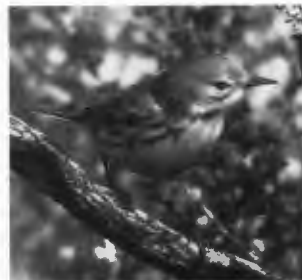
Prairie Warbler in Big Sycamore Canyon, Ventura County, California, October 14, 1990.

Large-billed Savannah Sparrows were again found along the coast of s. California with one at the Santa Ynez R. mouth Nov. 28–Dec. 1 (SEF) being the first in years for Santa Barbara , and up to four as far n. as Morro Bay Sept. 21–Oct. 5 (GPS). A Le Conte's Sparrow photographed at S.C.R.E. Sept. 23–24 (RJM) was one of very few to be found in California, and the first ever along the coast of s. California. A Sharp-tailed Sparrow at F.C.R. Sept. 22 (KR) was the first ever found inland in this Region in fall. Swamp Sparrows were a little more numerous than usual with 35± reported after Oct. 11. White-throated Sparrows were also numerous with 70± reported after Sept. 29, but Harris' Sparrows