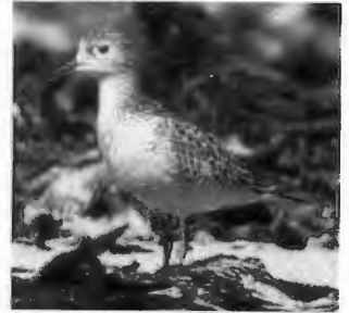
Buff-breasted Sandpiper at Morro Bay, California, September 1, 1990.

Four Buff-breasted Sandpipers were found with a juvenile inland at Edwards Sept. 16 (MTH), one photographed on Morro Bay Sept. 1 (EVJ), a remarkably late juvenile near Imperial Beach Oct. 21-25 (D & MH), and possibly the latest ever in North America at the same location Nov. 17-23 (REW). Reports of Ruffs included an adult remaining in Goleta through Sept. 8 (SEF), single juveniles at S.C.R.E. Sept. 15-24 (RJM), at Pt. Mugu Oct. 3-8 (RJM) and in Long Beach Sept. 8 (BED), and a re-