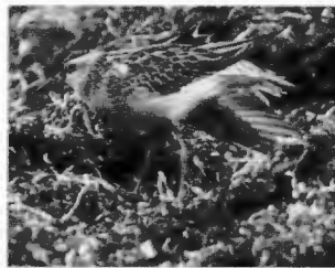
Juvenile Sharp-tailed Sandpiper at Montana de Oro State Park, California, November 11, 1990.

At least 30 juv. Semipalmated Sandpipers were found throughout the Region between Aug. 1 and Sept. 30, about an average number for this time of year. An ad. White-rumped Sandpiper in Irvine Sept. 9-13 (LRH, DRW) was only the 2nd to be found in s. California in fall. Baird's Sandpipers were slightly less numerous than usual, but included a late individual in Irvine Oct. 26-28 (DSi). Pectoral Sandpipers were decidedly rare this fall, but included a late individual