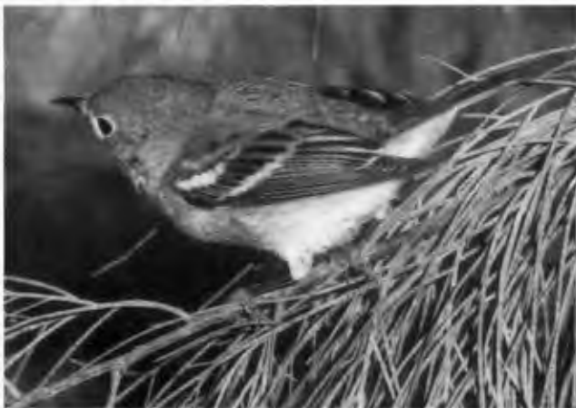
Chestnut-sided Warbler near Oxnard, California, on October 13, 1990. Photograph/Don Desjardin.

ley Oct. 27 (MAP), this being one of the rarest of the wood warblers to reach California. Tennessee Warblers were scarcer than normal with only 27 reported between Aug. 25 and Nov. 9. Fifteen Virginia's Warblers along the coast between Aug. 27 and Oct. 11 were fewer than expected, and the only two found inland were single birds near Santa Ynez, Santa Barbara , Sept. 27–28 (CP) and near Lancaster Sept. 3 (KLG). Reports of Lucy's Warblers on the coast, where quite rare, included single birds at Refugio S.B., Santa Barbara , Sept. 13–17 (SEF), in Goleta Nov. 22–Dec. 2 (RPH), at S.C.R.E. Sept. 4 (RJM), and near Imperial Beach Sept. 30–Oct. 2 (REW). Single N. Parulas, always scarce in fall, were along the coast in Oceano Sept. 29–Oct. 10 (DF), near Santa Maria Sept. 22 (PEL) and Sept. 30–Oct. 5 (DSt), and in Wilmington Sept. 27–Oct. 7 (MH), and inland at H.D.L. Oct. 3 (EAC) and at Finney L. near S.E.S.S. Sept. 14 (AME).