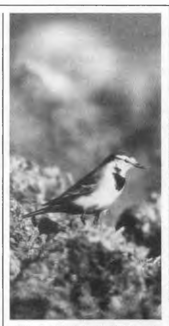
White (or Black-backed?) Wagtail in Monterey County, California, January 10, 1991.