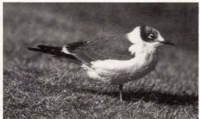
The season's only Franklin's Gull for northern California was this firstwinter bird, photographed at Palo Alto on January 28, 1991.