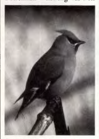
Bohemian Waxwing at Big Pine, California, January 8, 1991.

A Brown Thrasher, a rare straggler, was near Calexico Dec. 13 (WRR). A Sage Thrasher at L. Los Carneros near Goleta Jan. 8 (JPH), another in Irvine Dec. 24 (JB), and a 3rd in Orange Feb. 2 (BED) were along the immediate coast, where unusual in winter. The ad. White Wagtail found in Saticoy Nov. 8 was still present Mar. 9 (RJM). A Bohemian Waxwing was well