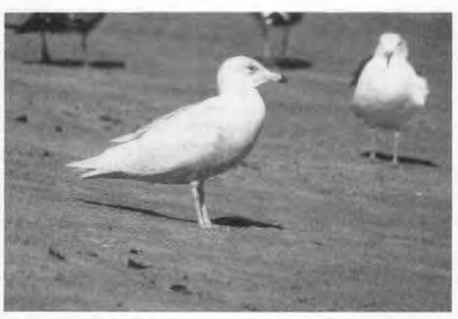
First-winter Glaucous Gull at the Santa Clara River Estuary, California, February 19, 1991.