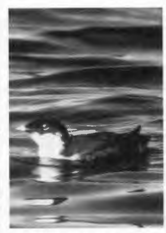
Ancient Murrelet at the Ventura Marina, California, January 1, 1991.

Reports of Xantus' Murrelets included one off Santa Barbara Dec. 29 (JLD), two off Newport Beach Jan. 20 (MTH), one off La Jolla Jan. 1 (DJ), and another off San Diego Jan. 28 (BRZ). A few Ancient Murrelets