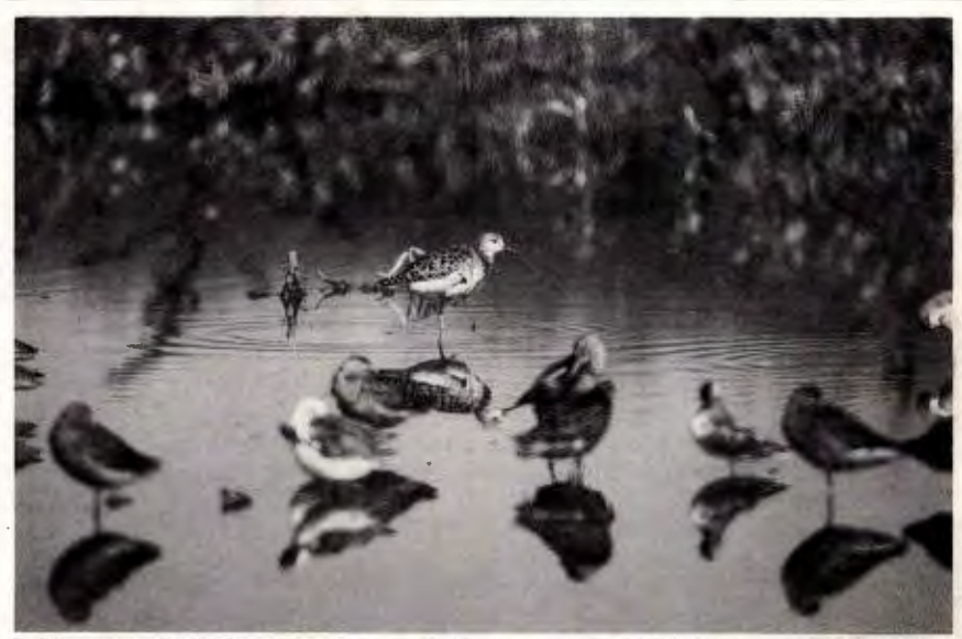
Ruff (center-with dowitchers) at Pt. Mugu, California, on July 18, 1992.