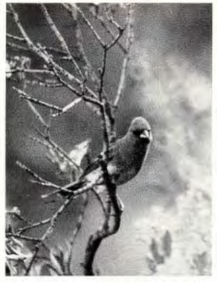
This first-year male Indigo Bunting mated with a female Lazuli Bunting and attempted nesting in Santa Clara County, California, in June 1993.