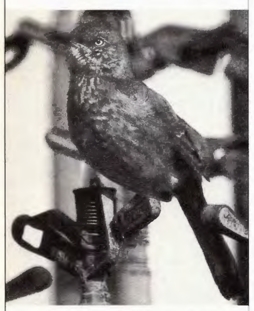
A rare visitor to the California coast, this Bendire's Thrasher was at Point Mugu, Ventura County, February 13, 1994.