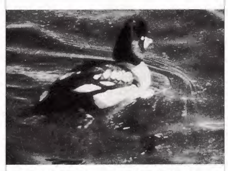
Rare in the coastal slope of southern California was this male Barrow's Goldeneye on Lake Cachuma, Santa Barbara County, January 17, 1994.

Goleta, Santa Barbara (PEL), another was in Mira Loma, Riverside Dec. 19 (MAP), and a third was near San Jacinto Dec. 21 (DG); this hybrid is regularly encountered