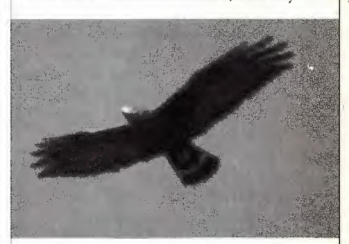
A scattering of Zone-tailed Hawk reports over southern California was unusual, especially for the winter season. This adult was over Ojai, Ventura County, at the end of February 1994.