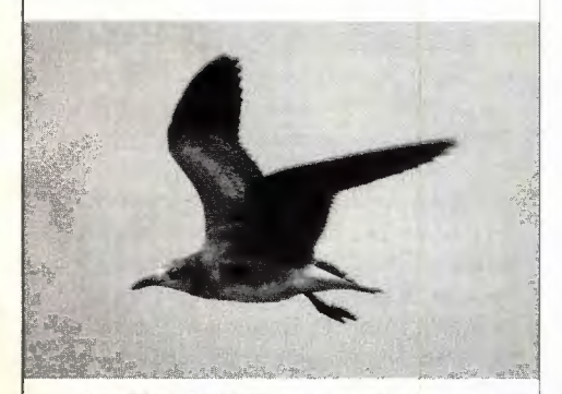
Surprisingly far inland, and at an odd season, was this first-winter Laughing Gull at Bakersfield, California, December 30, 1993.