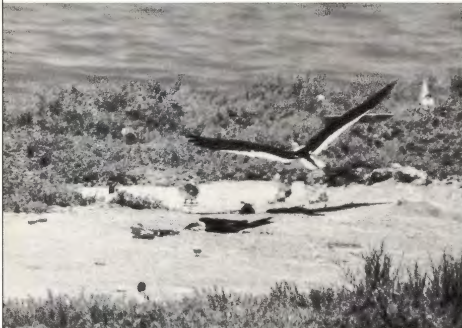
Pair of Black Skimmers at nest with eggs at Mountain View, Santa Clara, California, July 13, 1995.