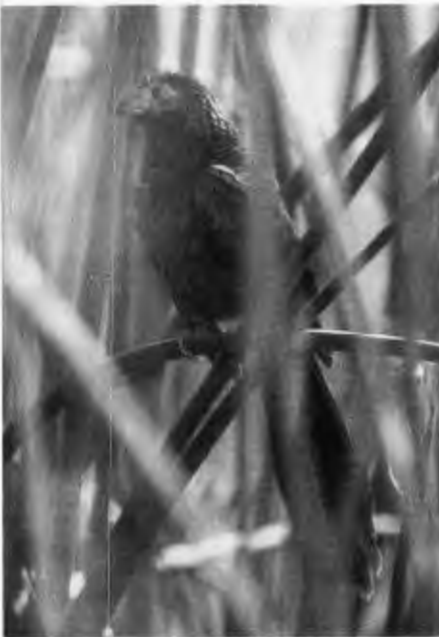
GROOVE-BILLED ANI in Los Angeles County, California, December 4, 1995. About the tenth state record.