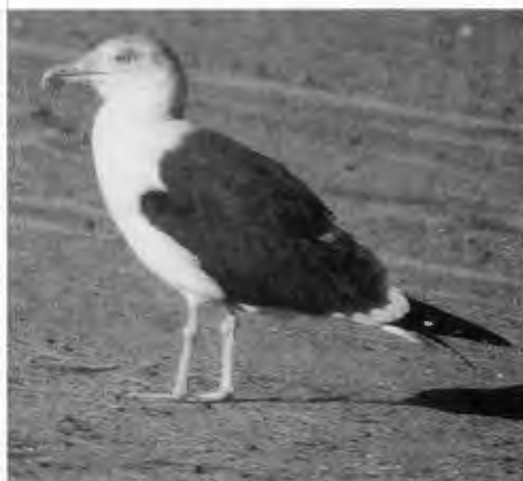
Adult Lesser Black-backed Gull at Oceanside, California, March 2, 1996. One of three present in the region this winter.