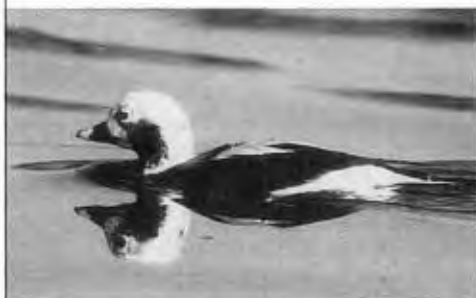
Adult male Oldsquaw in Riverside, California, November 30, 1995.