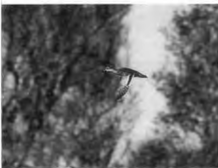
Male Garganey in flight near the mouth of the Santa Ynez River, California, January 2, 1996.

The Harris Hawk that returned to San-tee, San Diego , Oct. 11 for its 2nd winter could not be found after Jan. 10 (RS), but ≤seven around Borrego Springs, San