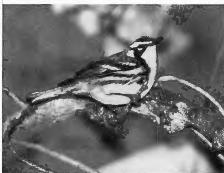
Yellow-throated Warbler at Ramer Lake, California, January 14, 1996.

Remarkable was a Grace's Warbler associating with Pygmy Nuthatches and other such mountain species at 5400 ft. in the San Gabriel Mts., Los Angeles , Oct. 22–Mar. 3 (TK), surviving snow storms and below-freezing temperatures during its stay. A ♂ Prairie Warbler found in Santee Mar. 31 (DY) had undoubtedly been present all winter. Only six Palm Warblers were reported, but four of these were inland, where unexpected, including single birds at the Hidden Valley Wildlife Area near Riverside Jan. 27–Feb. 4 (RodH), Desert Center,