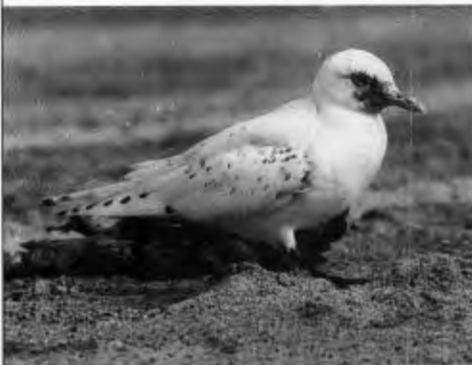
ASTOUNDING was this immature Ivory Gull found in far southern California at Dana Point January 5, 1996. A first for California, it apparently provided the southernmost record ever for the species.

another first-winter bird photographed at S.E.S.S., Dec. 17–Feb. 10 (RogH) were inland, where accidental. A Red-legged Kittiwake picked up in a weakened condition in Anaheim, Orange , Feb. 28 was taken to a local animal shelter, where it died 2 weeks later (DRW, * L.A.C.N.H.M.); since there are 5 records for the Oregon coast, this species was expected in n. California waters, but not inland at an apartment complex in s. California. Totally unexpected was a first-winter Ivory Gull photographed at Dana Pt., Jan. 5 (JW); this was the first to be found in California, and established the southernmost locality for this species not only in North America but the entire Northern Hemisphere.