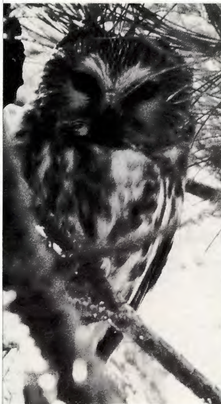
A rare visitor to the desert regions of southern California was this Northern Saw-whet Owl in a Christmas-tree farm near Ridgecrest December 6, 1996.

The number of White-winged Doves wintering along the w. edge of the Colorado Desert in e. San Diego increases each winter, with flocks of 10–15 present at multi-