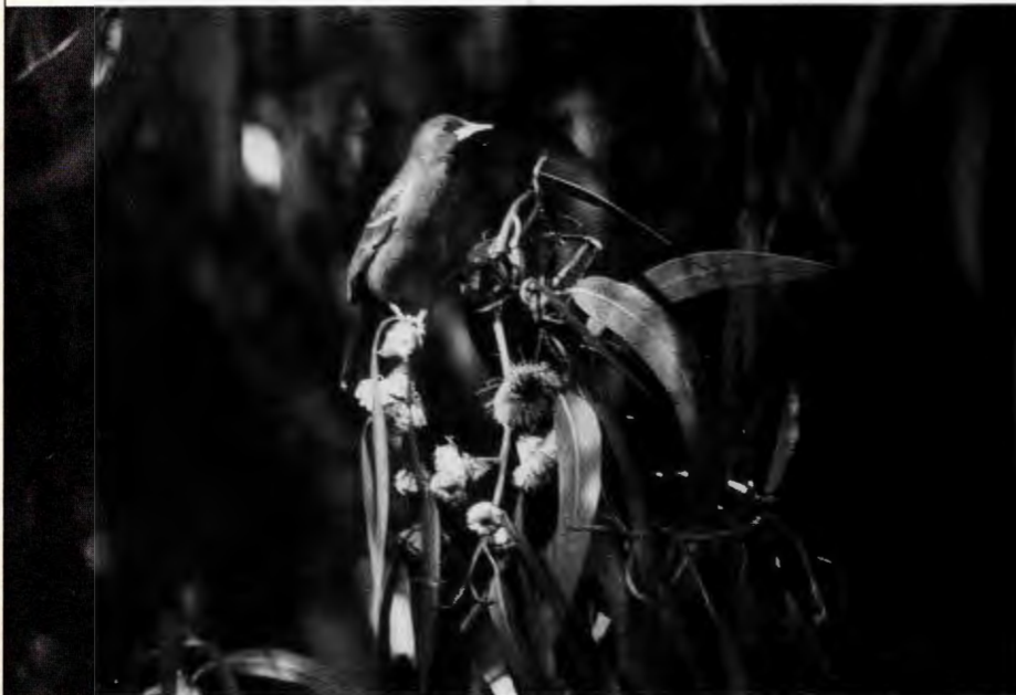
Providing a sixth record for California, this Streak-backed Oriole (photographed January 3, 1997) remained for three months in a small park in Huntington Beach.

probably wintering locally. The only Chestnut-collared Longspurs reported were two near Lakeview Jan. 31 (CMcG).