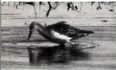
Ruff foraging near Point Mugu, California, February 22, 1997.

sheep near Brawley Jan. 31 (RHigson) was the 2nd to be reported in Imperial , but the condition of its wing-feathers suggested it had recently been in captivity.