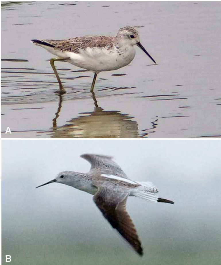
Figure 4. Unlike California's first Marsh Sandpiper, photographed on a single day by a single observer, its second, southeast of Dixon, Yolo Co., 9–13 Apr 2014 (2014-032), lingered for five days and was seen and photographed by many observers. The long, thin, straight, dark bill and white wedge on the back help identify this species.