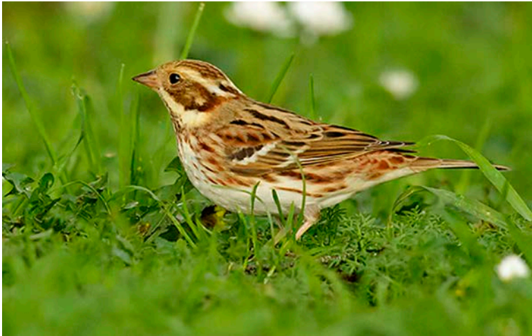
Figure 10. This Rustic Bunting, which lingered in Golden Gate Park, San Francisco, from 6 Dec 2014 to 30 Mar 2015 (2014-148), was the first recorded in California since 1996 and only the fifth overall.