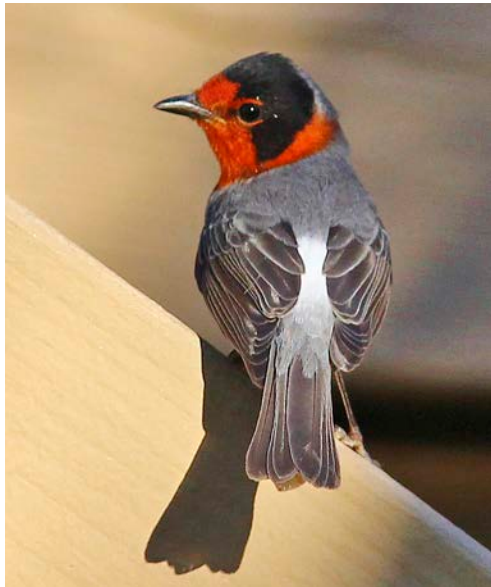
Figure 9. This first-fall male Red-faced Warbler at Galileo Hill Park, Kern Co., 7-8 Oct 2014 (2014-107) established the latest date for the species in California and the first record for Kern Co.