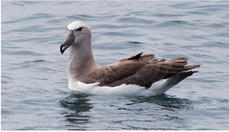
Figure 1. This Salvin's Albatross off Half Moon Bay, San Mateo Co., 26 Jul 2014 (2014-069) was the first recorded in California and only the second for North America. The mostly white underwings with a small black intrusion at the very base of the leading edge identify it as one of the Shy Albatrosses (see photo on this issue's front cover), the gray hood limits it to Salvin's or Chatham, and the gray bill lacking yellow coloration eliminates the Chatham Albatross.