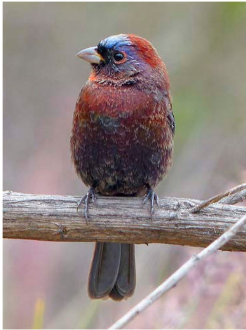
Figure 11. Varied Bunting, along the San Gabriel River near Duarte, Los Angeles Co., 26 Mar–20 Apr 2014, representing the fourth record for California.