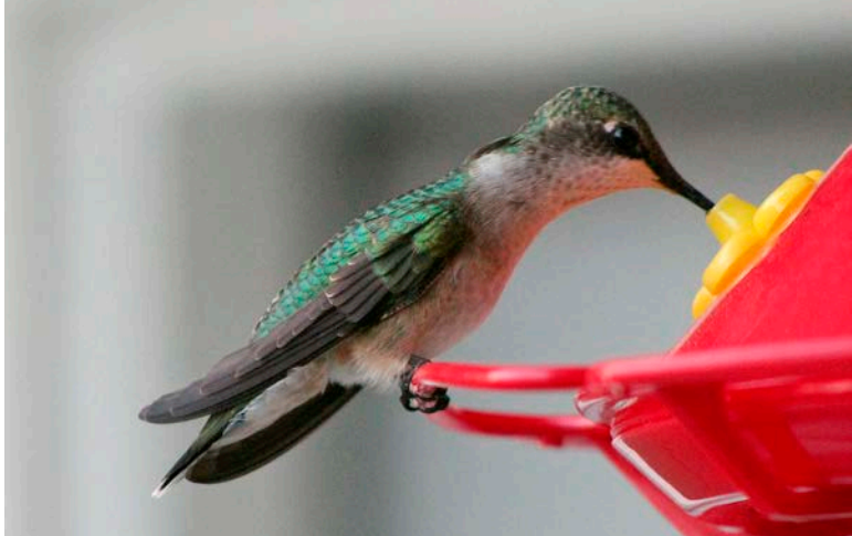
Figure 6. This juvenile female Ruby-throated Hummingbird found in Eureka on 3 Sep 2014 (2014-080) was the second of that species recorded in Humboldt County. Distinguishing this species from the Black-chinned Hummingbird ( A. alexandri ) can be extremely difficult, but note the clean white throat, black mask, green crown, tail projecting well beyond the wingtips, and especially the narrow and tapered tenth primary just visible behind the broader ninth primary.