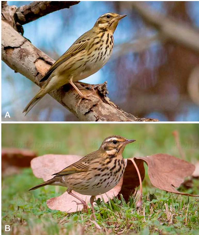
Figure 8. California's second Olive-backed Pipit at Yorba Regional Park in Anaheim, Orange Co., 1–5 Nov 2014 (2014-123), only the fourth of this species recorded in North America away from Alaska and Hawaii. Note the strong olive tinge to the upperparts, bicolored supercilium bordered above by a strong blackish lateral crown stripe, dark spot in the rear of the auricular, and heavily black-spotted breast with an underlying buffy wash contrasting with an unmarked white belly.