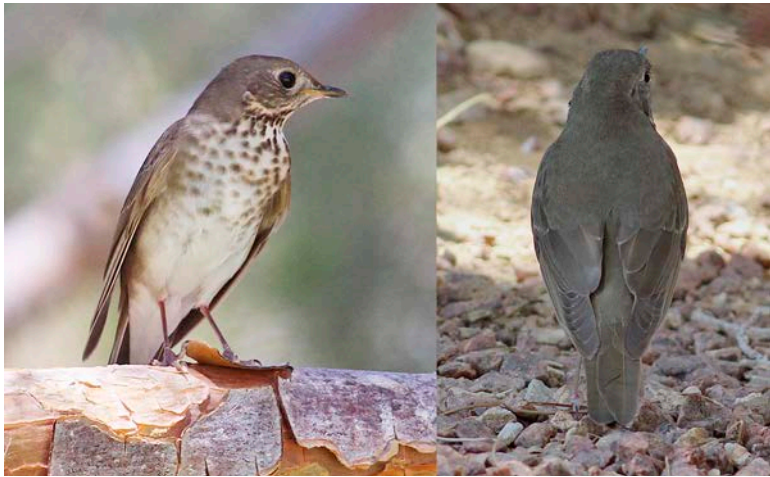
Figure 7. This Gray-cheeked Thrush at Primm, San Bernardino Co., 7 Jun 2014 (2014-048) represents both California's third spring record and its third inland record. Distinguishing the Gray-cheeked Thrush from other Catharus thrushes is challenging, but the uniform cold gray-brown of the plumage, splotchy pale whitish pattern around the eyes and cheeks not forming distinct spectacles or eye-ring, and heavily spotted breast are all typical of this species.