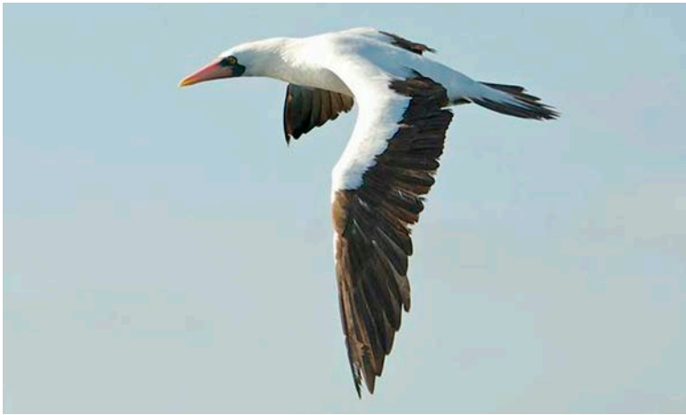
Figure 3. California's second Nazca Booby was photographed during a whale-watching trip southwest of Pt. Vicente, Los Angeles Co., on 27 Jun 2014 (2014-063). The pinkish orange bill and extensively white central rectrices distinguish this bird from the Masked Booby.